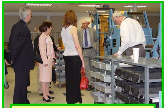
KFC and CCC officials discuss the check disbursement process.