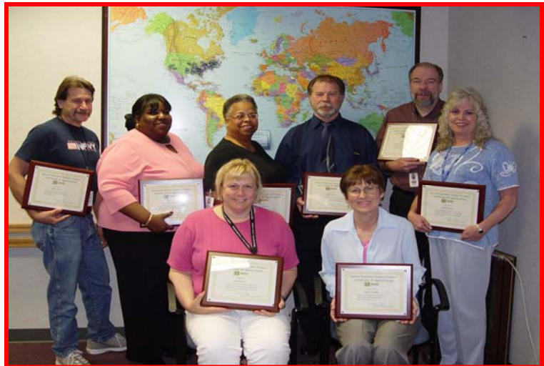
SPS Team Members are recognized for their work on the SPS rollout.