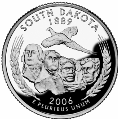
South Dakota Commemorative Quarter-Dollar Coin

In a conference report to Public Law 104-52 that created the United States Mint Public Enterprise Fund (PEF), Congress directed the United States Mint to report quarterly on implementation of the PEF. This report is designed to fulfill that requirement.