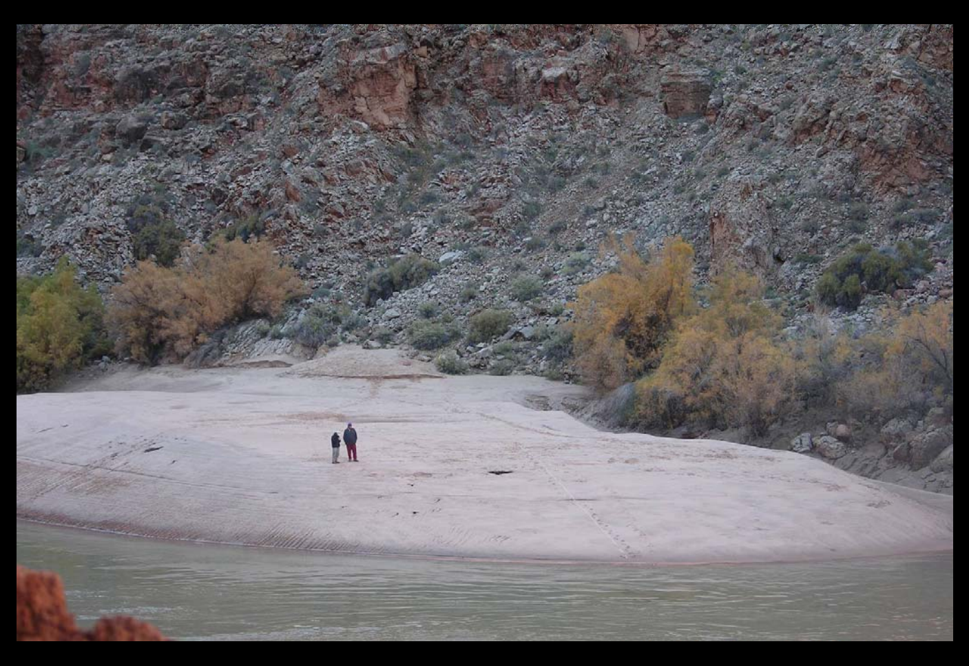
After High Flow - November 26, 2004 - 8,000 cfs - Note HFT water line