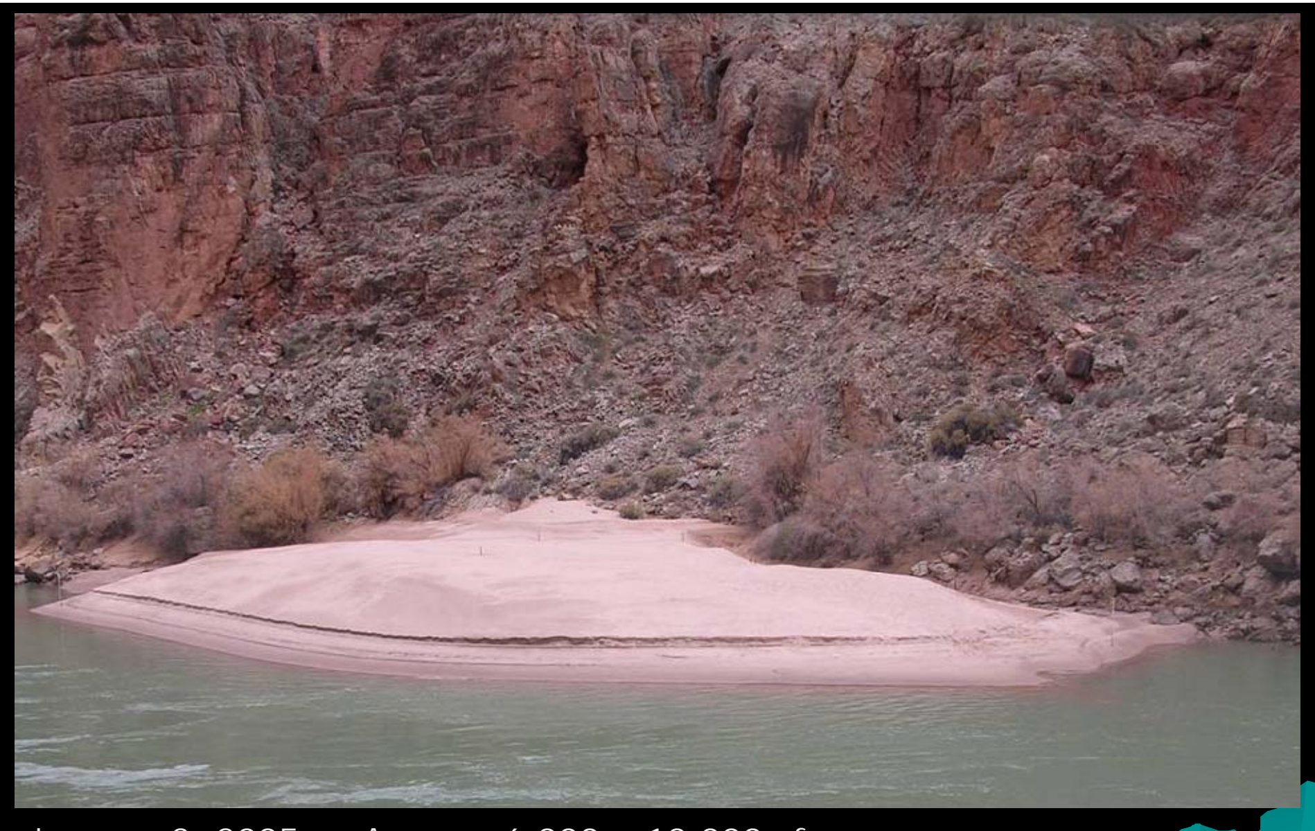
January 3, 2005 - Approx. 6,000 - 10,000 cfs