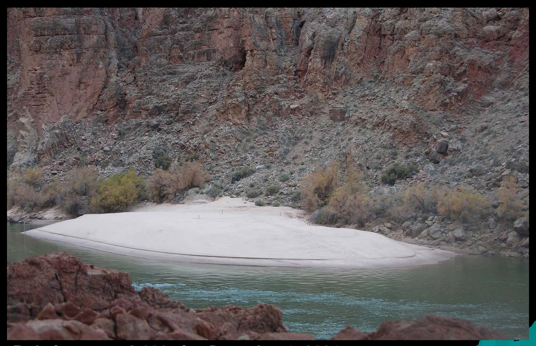
End of constant 8,000 cfs - December 4, 2004

- Daily fluctuating flows between 11,700 and 6,500 cfs begin Dec. 6, 2005