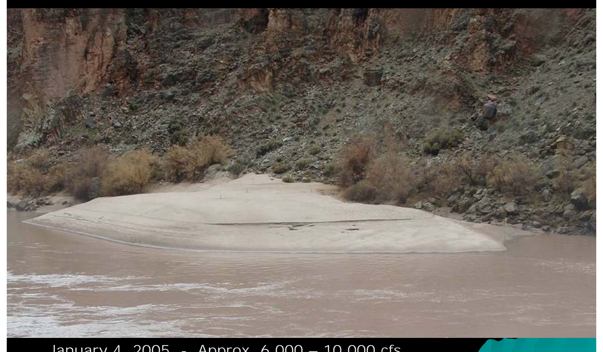
January 4, 2005 - Approx. 6,000 - 10,000 cfs