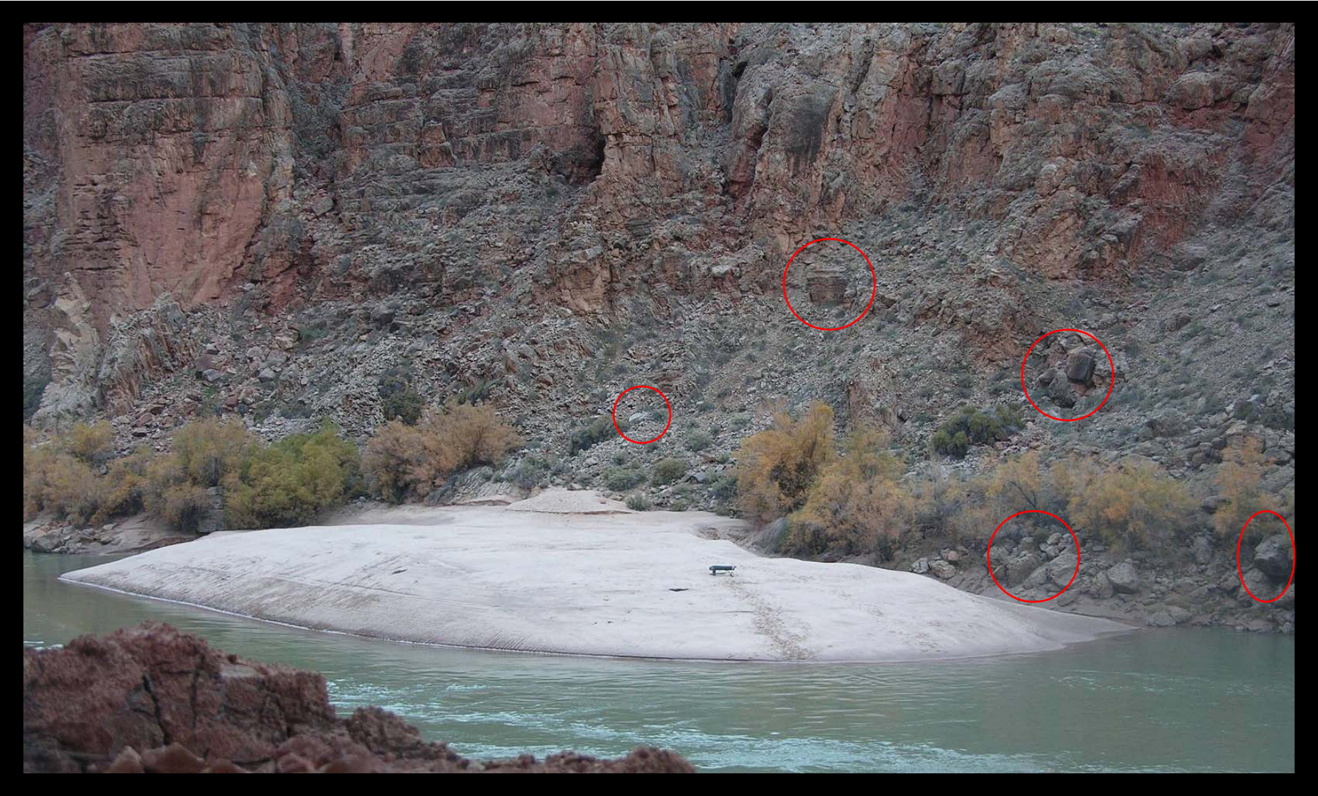
After High Flow - November 26, 2004 - 8,000 cfs