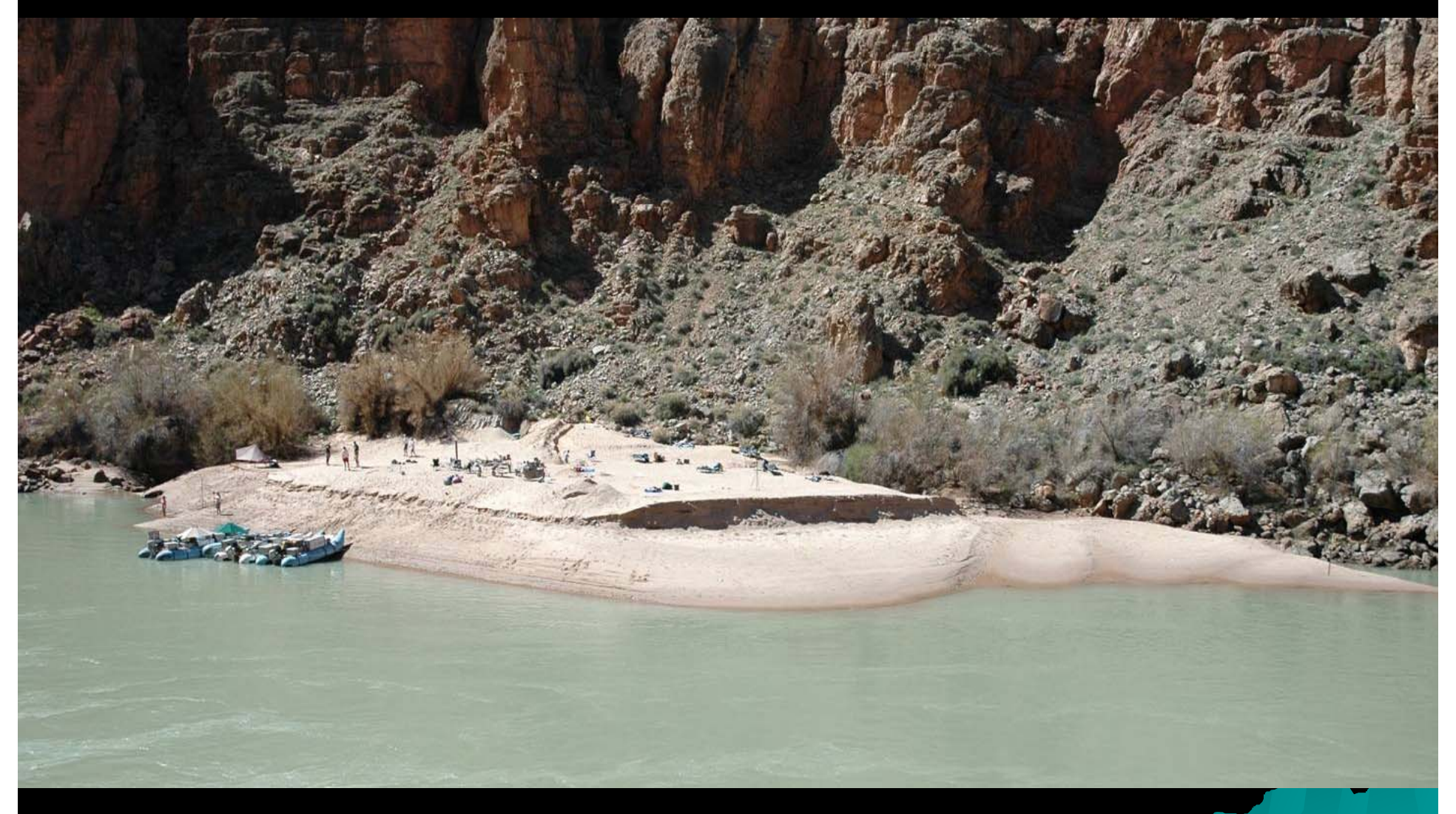
March 9, 2004 - Approx. 6,000 - 10,000 cfs