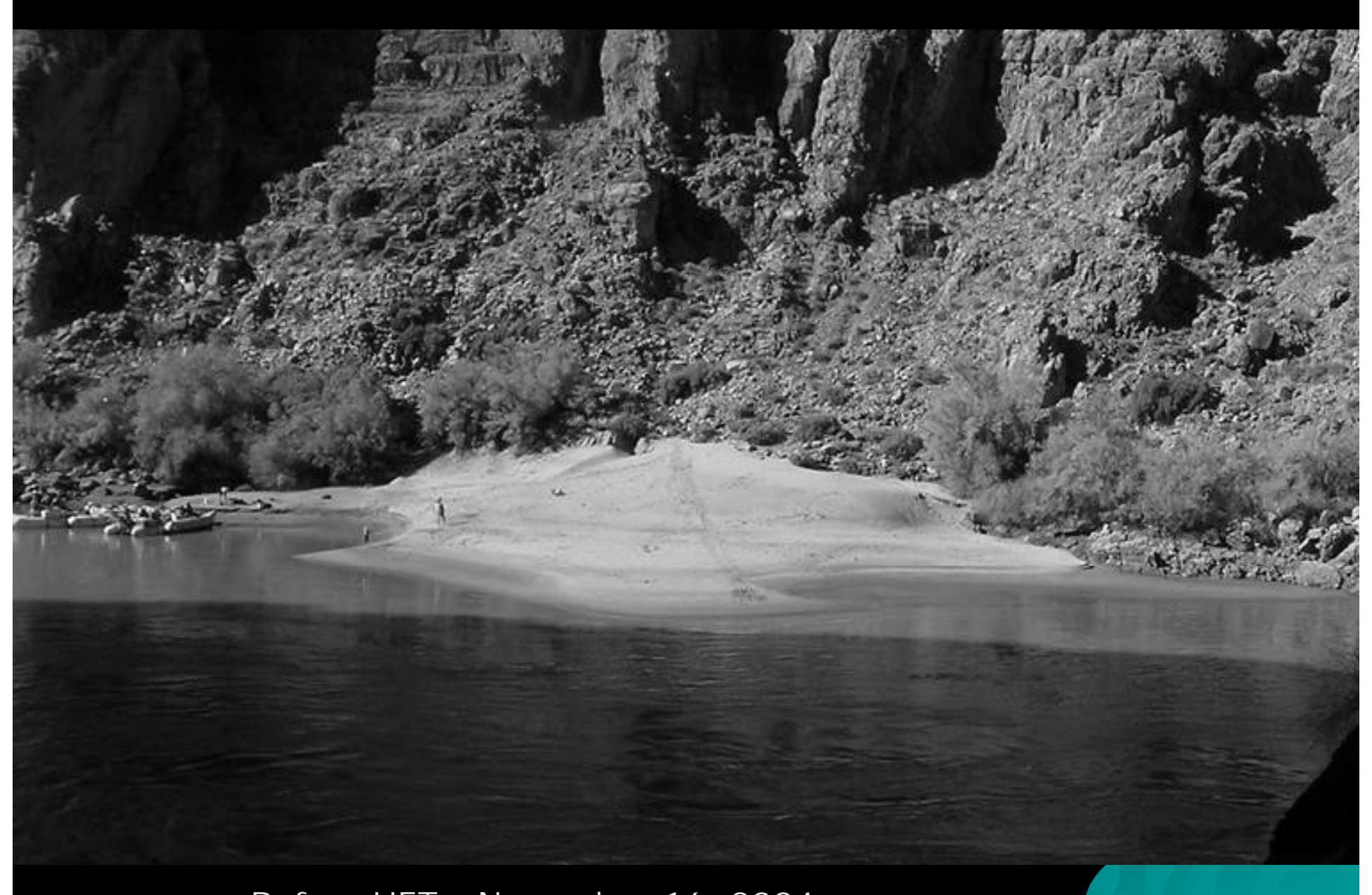
Before HFT - November 16, 2004