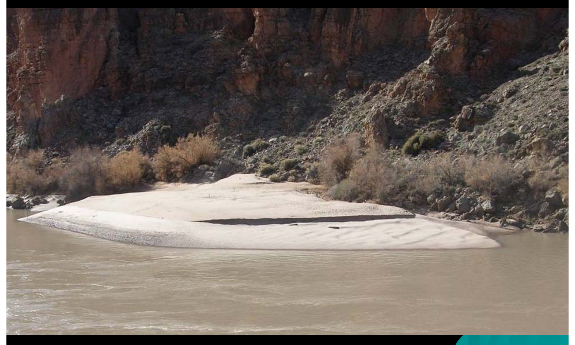
January 5, 2005 - Approx. 6,000 - 10,000 cfs