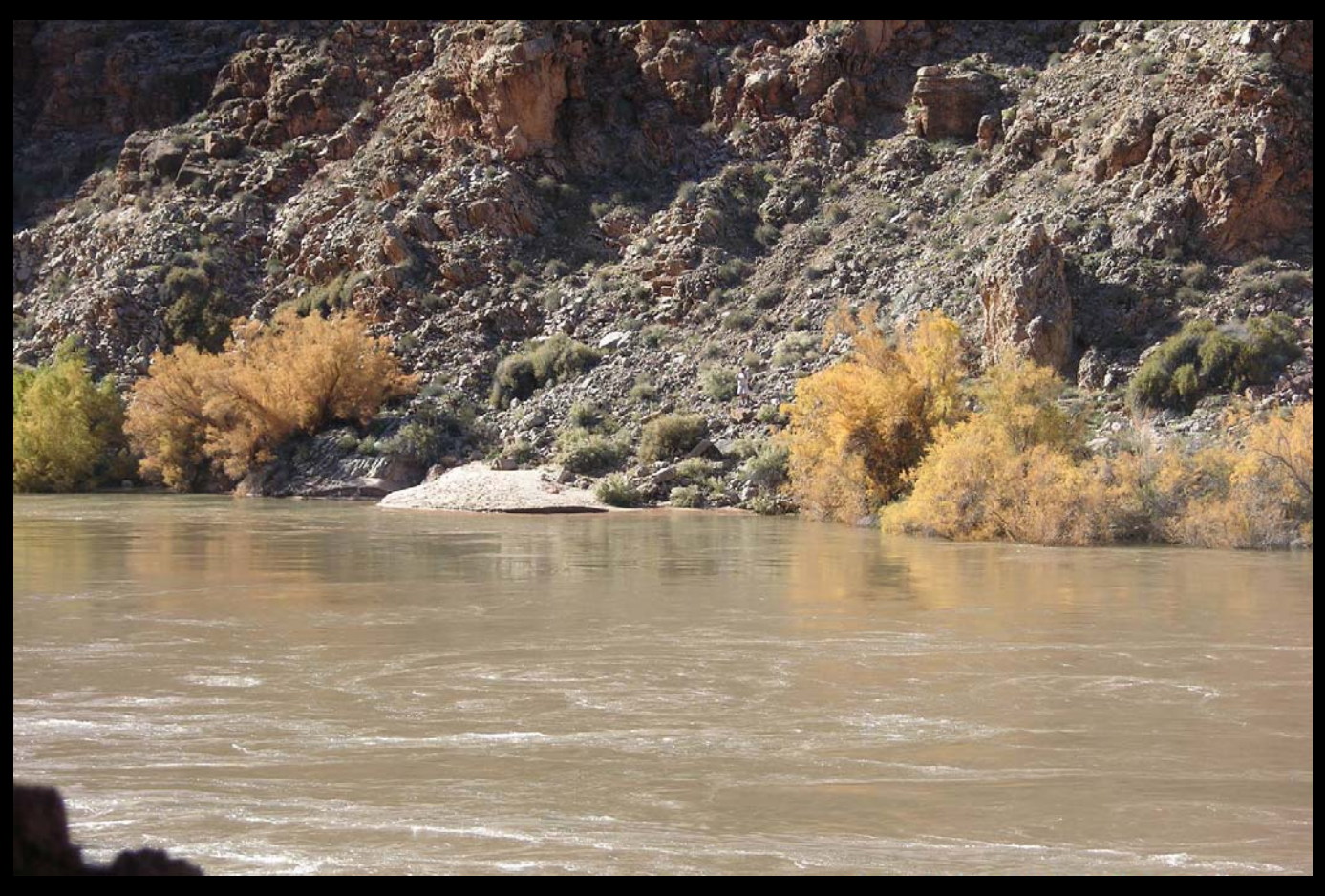
During High Flow November 24, 2005 42,000cfs