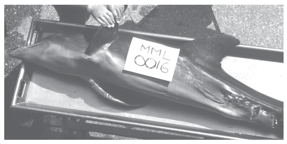
Figure 4. Four-year-old male dolphin calf, the son of a begging mother, that died within six weeks of being observed begging in the region occupied by Beggar; note the severe emaciation, presumed boat propeller cuts on the peduncle, healed entanglement scars at the base of the pectoral flippers, and shark bite scar.

(Wells & Scott, 1997). Although the specific role of begging in the sequence of events that led to this dolphin's demise cannot be determined, it is clear that this animal, a known beggar and the son of a begging mother, was involved in a surprisingly high number of adverse human interactions.