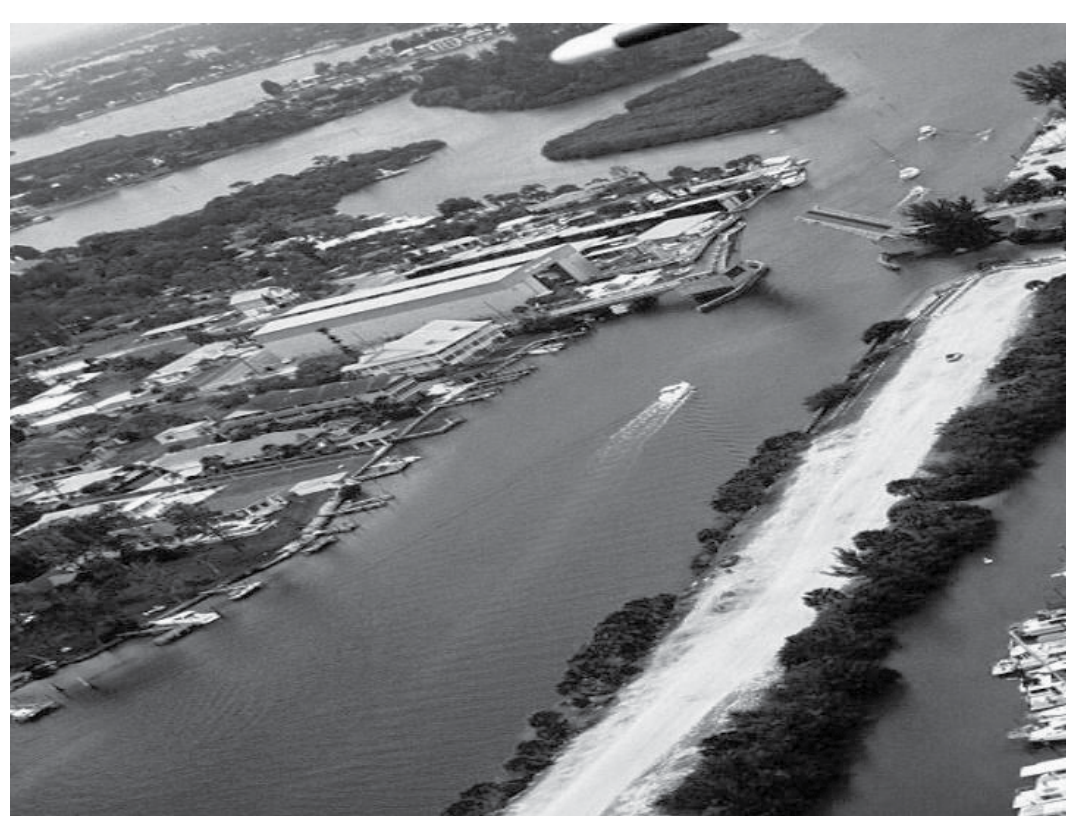
Figure 1. Aerial view of Albee Road Bridge study area, near Sarasota Bay, Florida; north is to the left.

We recorded the date, time, dolphins present, boat type, size, and identification information, including private vs. commercial ownership (as possible); a description of the initiation of each interaction attempt; and the dolphin's behavioral responses. Interactions were defined as follows: attempts to interact with the dolphin by pounding on the side of the boat, splashing the water,