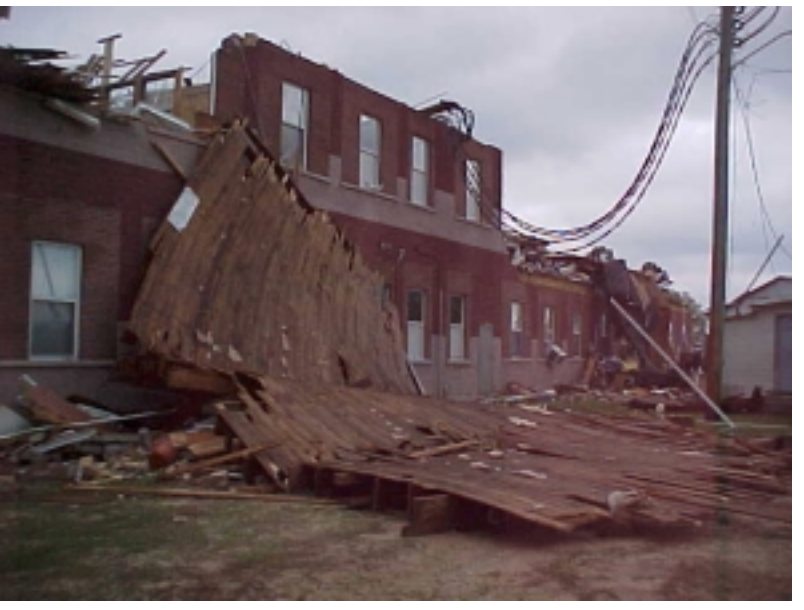
F3 damage to the Mize Attendance Center. Second floor almost totally taken off.