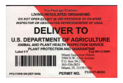
FIGURE 1: Green and Yellow and Red and White Mailing Labels