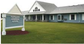
Napoleon Care Center