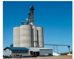
Crete Grain Co., Inc.