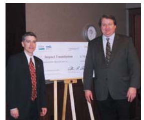
Impact Foundation, Inc.