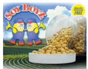
Soy BoyZ, Inc., http://soyboyzinc.com/index.html