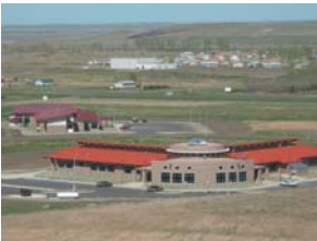
Sitting Bull Community College