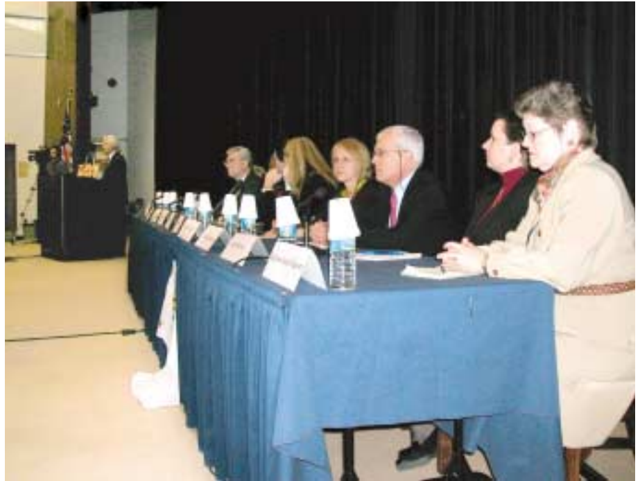
Panelists answer questions about serving in Iraq and Afghanistan.