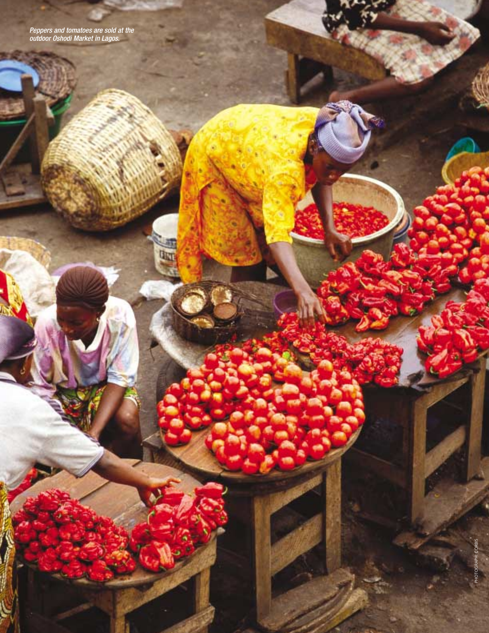
Peppers and tomatoes are sold at the outdoor Oshodi Market in Lagos.