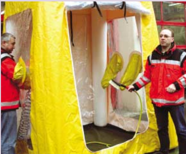
Chemical-biological first responders demonstrate decontamination techniques.