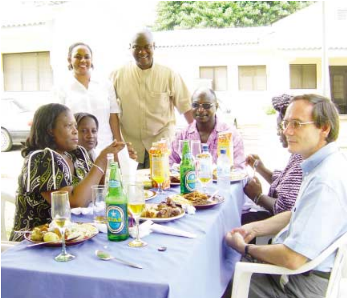
Above: American and local staff party with Nigerians and members of other missions.

affairs officer, watched technical problems mar the electoral process in an eastern state. Anxiously, she returned the next week to see if Nigerians would maintain the civilian transition. In an area known as Biafra, which violently tried to secede