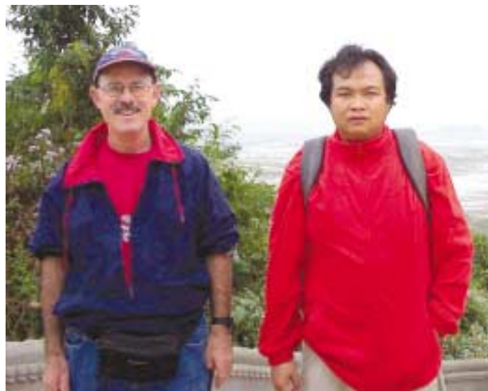
The author and guide on a ridge in northern Laos.

Our last stop on the second day was a stupa, a Buddhist religious monument called That Poum Pouk. This stupa was constructed as part of a competition between the Lanna Kingdom, based in what is now northern Thailand, and the Lane Xang Kingdom, based in what is now Luang Prabang, the ancient capital of Laos. It was an effort to prove which kingdom was more