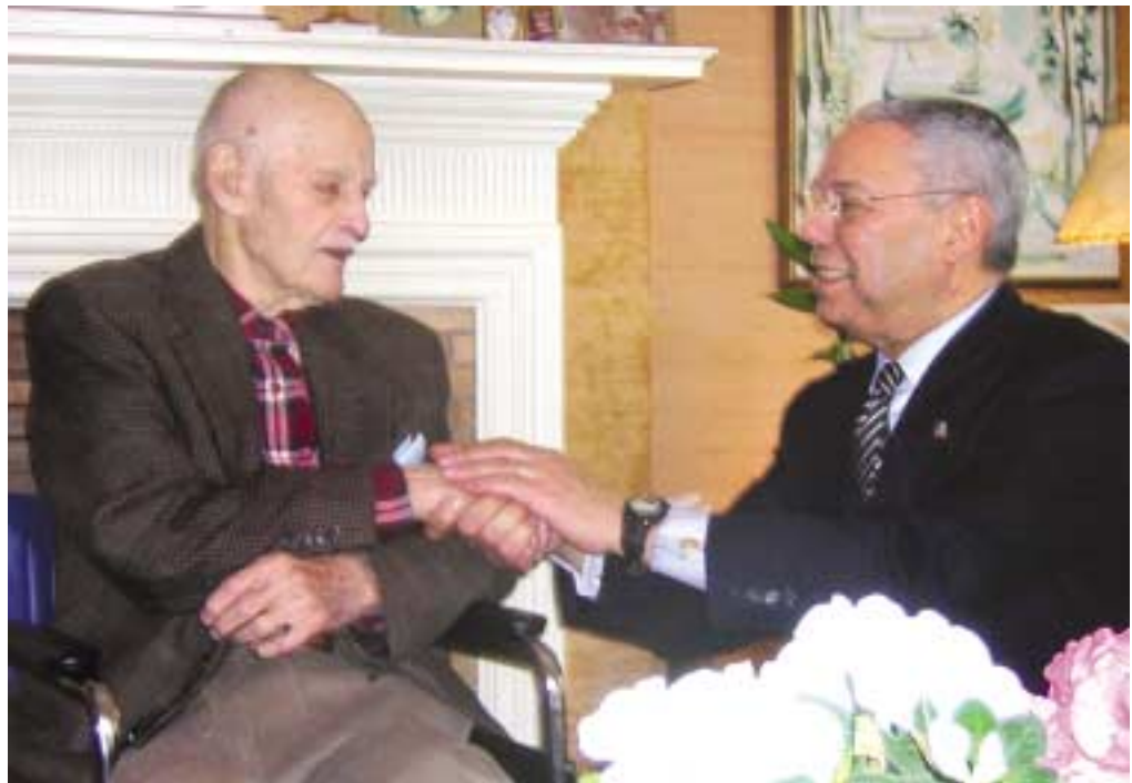
Secretary Powell congratulates Ambassador Kennan on his 100th birthday.

At close range the young George Kennan saw the will to power take its 20th century form, first in communism, then fascism and totalitarianism. He foresaw the darkness totalitarian regimes would spread, and he saw many fail to understand that enemy's true character. Such an experience could have made any young person a pessimist, but George Kennan knew that if we proved true to our ideals, we would prevail in the end. That's