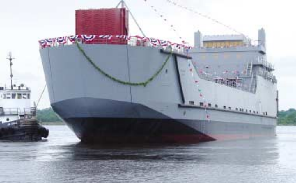
Above: The newly christened Major General Robert Smalls takes to the water. Below: Smalls, circa 1862.