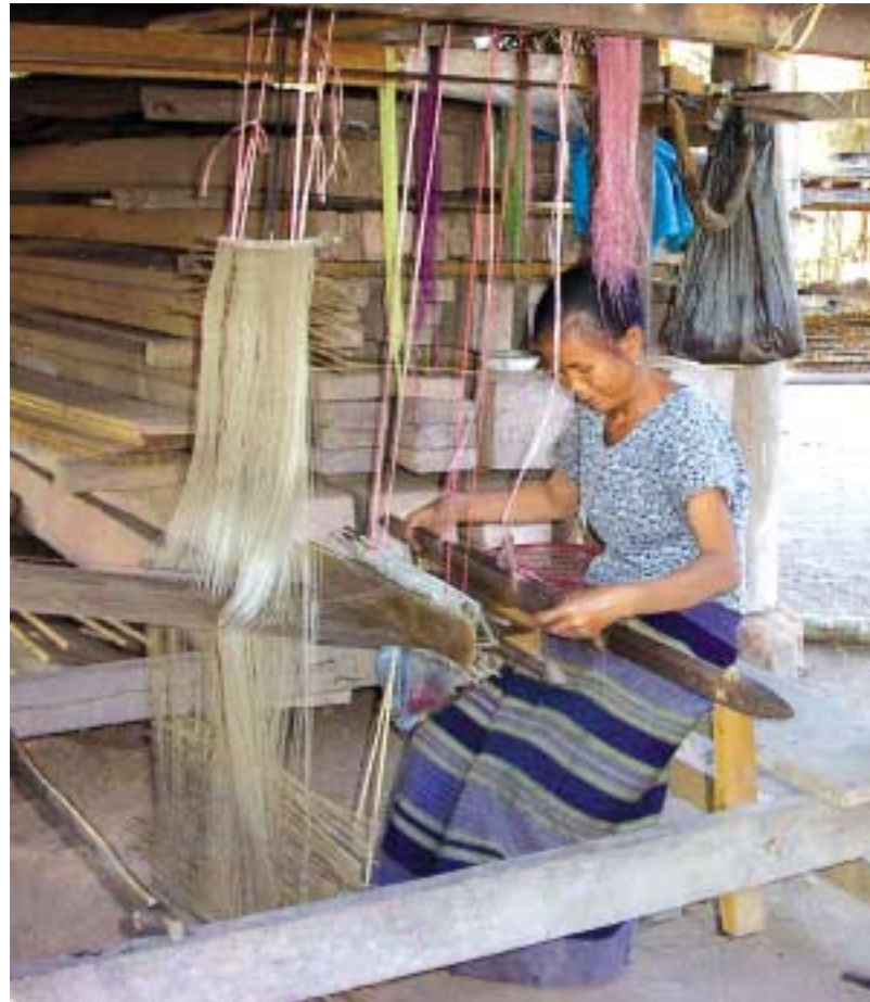
A woman weaves silk in a northern Lao village.

During our lunch at the village chief's house, we learned that this village had relocated a number of years ago from the nearby mountains because there was more arable land and water available at the lower elevation. Until about four years ago, the chief said, Ban Nam