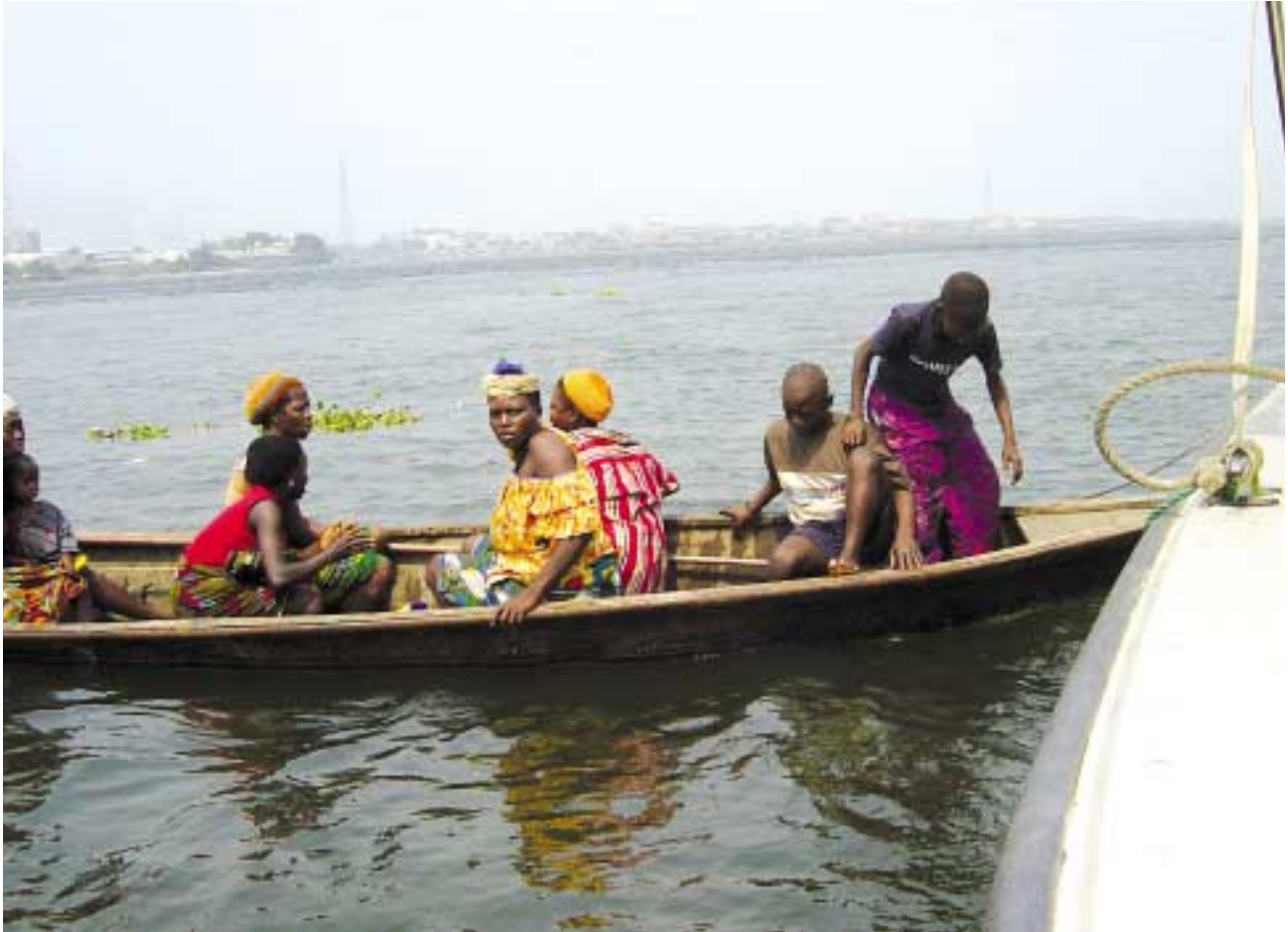
Above: The consulate general owns four speedboats to transport employees to and from work and, occasionally, to rescue stranded fishing boats. Below: A construction crew erects a press platform for the President's visit last July.

“Na true,” affirmed one of my police escorts. While Femi isn’t as popular at home as his father Fela—a musical icon of free love, marijuana and democracy until his death from AIDS in 1997—he still draws large crowds. His New Africa Shrine, which resembles an open-sided airport hangar, is sized extra large—like everything in Lagos—to fit big crowds.