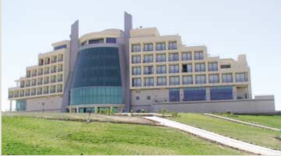
Above: The Coalition Provisional Authority's Northern Iraq headquarters is a converted resort hotel that accommodates 100 staff. It's arguably the best in Iraq. Below: A donkey train—or walking—is the only way to visit a coalition refugee site in the mountains north of Erbil.

not many of which would be understood or appreciated in Foggy Bottom.”