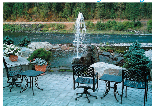
The Fountain at Dining on the Edge

Through USDA's Rural Development Business & Industry Loan Guarantee Program, over $7.1 million in loan guarantees have been made to AmericanWest Bank for the restaurant, lumber mill, senior housing facility, and motel. Other USDA RD programs have contributed over $100,000 in grant funds, including a $25,183 grant in June of 2005 to the Clearwater Economic Development Association (CEDA) in Lewiston, which added much needed dollars to their micro-loan revolving fund.