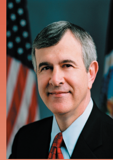
Mike Johanns Secretary of Agriculture