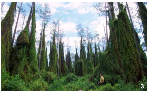
Figure 3 Environment infested with Lygodium microphyllum

These climbing ferns spread prolifically, scrambling over vegetation, creating a fire hazard, smothering native plant communities and causing other harmful environmental and economic impacts.