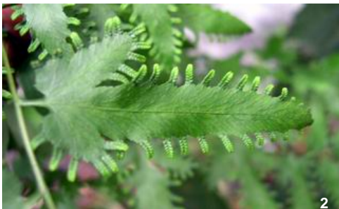
Figure 2 Fertile fronds with sporangia