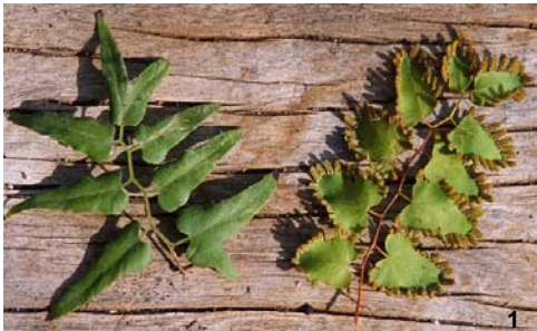
Figure 1 Fertile and sterile fronds