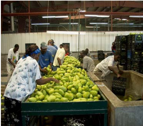
Haitian workers sort washed mangoes for export.

Grown exclusively in Haiti, the award-winning Haitian Francique mango has irresistible tropical aroma and sweetness. The primary importer of Francique mangoes is the United States.