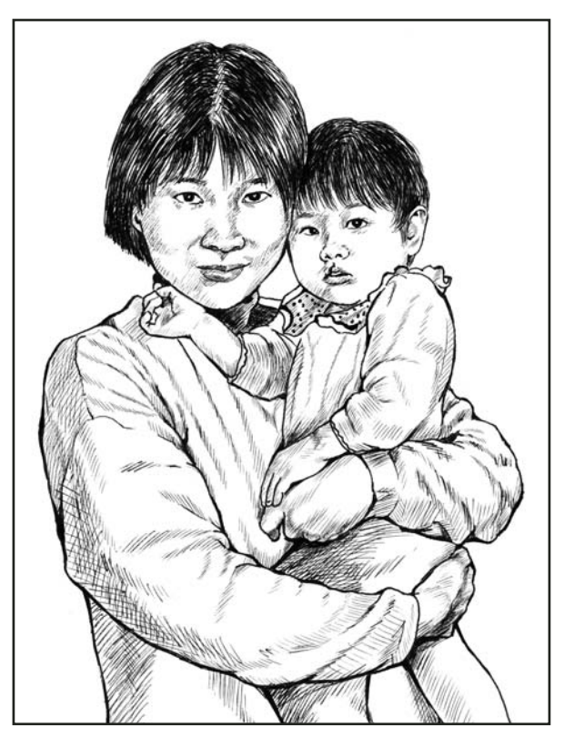
After you have your baby, you can do a lot to prevent or delay type 2 diabetes.

You will probably have a blood glucose test 6 to 12 weeks after your baby is born to see whether you still have diabetes. For most women, gestational diabetes goes away after pregnancy. You are, however, at risk of having gestational diabetes during future pregnancies or getting type 2 diabetes later.