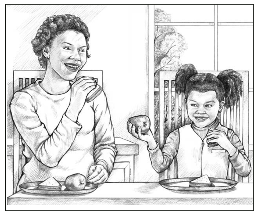
Using a meal plan will help keep your blood glucose in your target range.