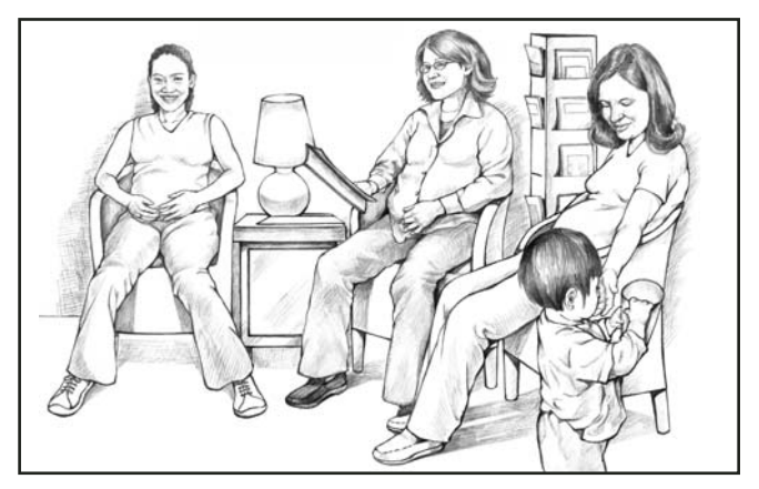
Gestational diabetes is diabetes that is found for the first time when a woman is pregnant.

This booklet is for women with gestational diabetes. If you have type 1 or type 2 diabetes and are considering pregnancy, call the National Diabetes Information Clearinghouse at 1–800–860–8747 for more information and consult your health care team before you get pregnant.