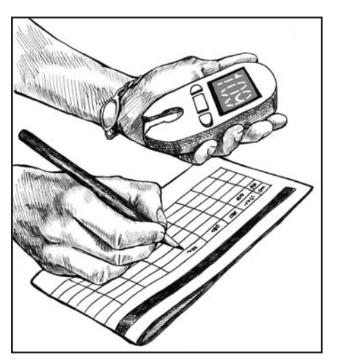
Each time you check your blood glucose, write down the results.

Each time you check your blood glucose, write down the results in a record book. Take the book