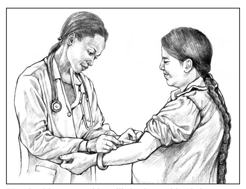
Your health care provider will check your blood glucose level to see if you have gestational diabetes.