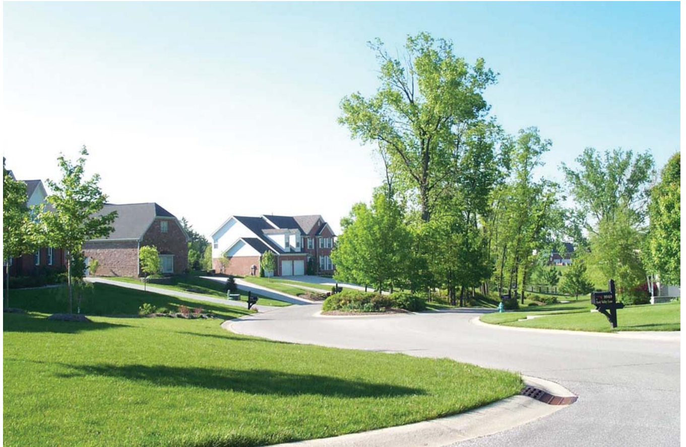
Figure 16.—A new subdivision in an area of Miami silt loam, 2 to 6 percent slopes, eroded, in Zionsville.

favorable for the specified use. Good performance and very low maintenance can be expected. Somewhat limited indicates that the soil has features that are moderately favorable for the specified use. The limitations can be overcome or minimized by special planning, design, or installation. Fair performance and moderate maintenance can be expected. Very limited indicates that the soil has one or more features that are unfavorable for the specified use. The limitations generally cannot be overcome without major soil reclamation, special design, or expensive installation procedures. Poor performance and high maintenance can be expected.