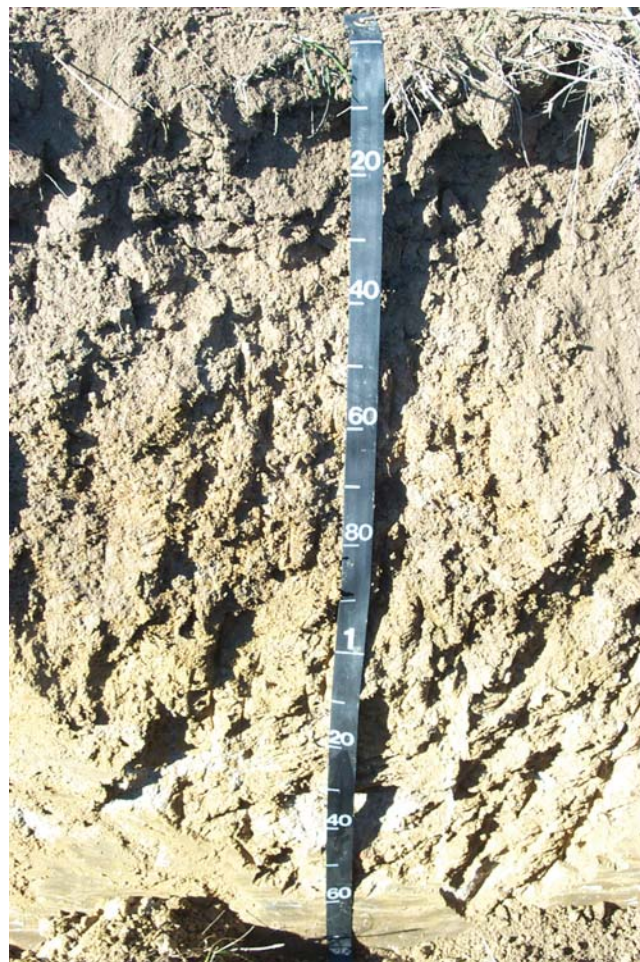
Figure 25.—Profile of Fincastle silt loam, 0 to 2 percent slopes.

Ap—0 to 10 inches; dark grayish brown (10YR 4/2) silt loam, pale brown (10YR 6/3) dry; moderate fine