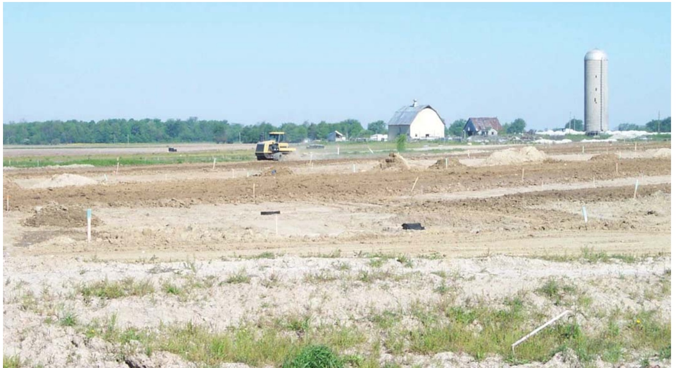
Figure 12.—A new subdivision in an area of Crosby silt loam, 0 to 2 percent slopes, near Whitestown.

The map units in the survey area that are considered prime farmland are listed in table 7. This list does not constitute a recommendation for a particular land use. On some soils included in the list, measures that overcome a hazard or limitation, such as flooding and wetness, are needed (fig. 13). Onsite evaluation is needed to determine whether or not the hazard or limitation has been overcome by corrective measures. The extent of each listed map unit is shown in table 4. The location is shown on the detailed soil maps. The soil qualities that affect use and management are described under the heading "Detailed Soil Map Units."