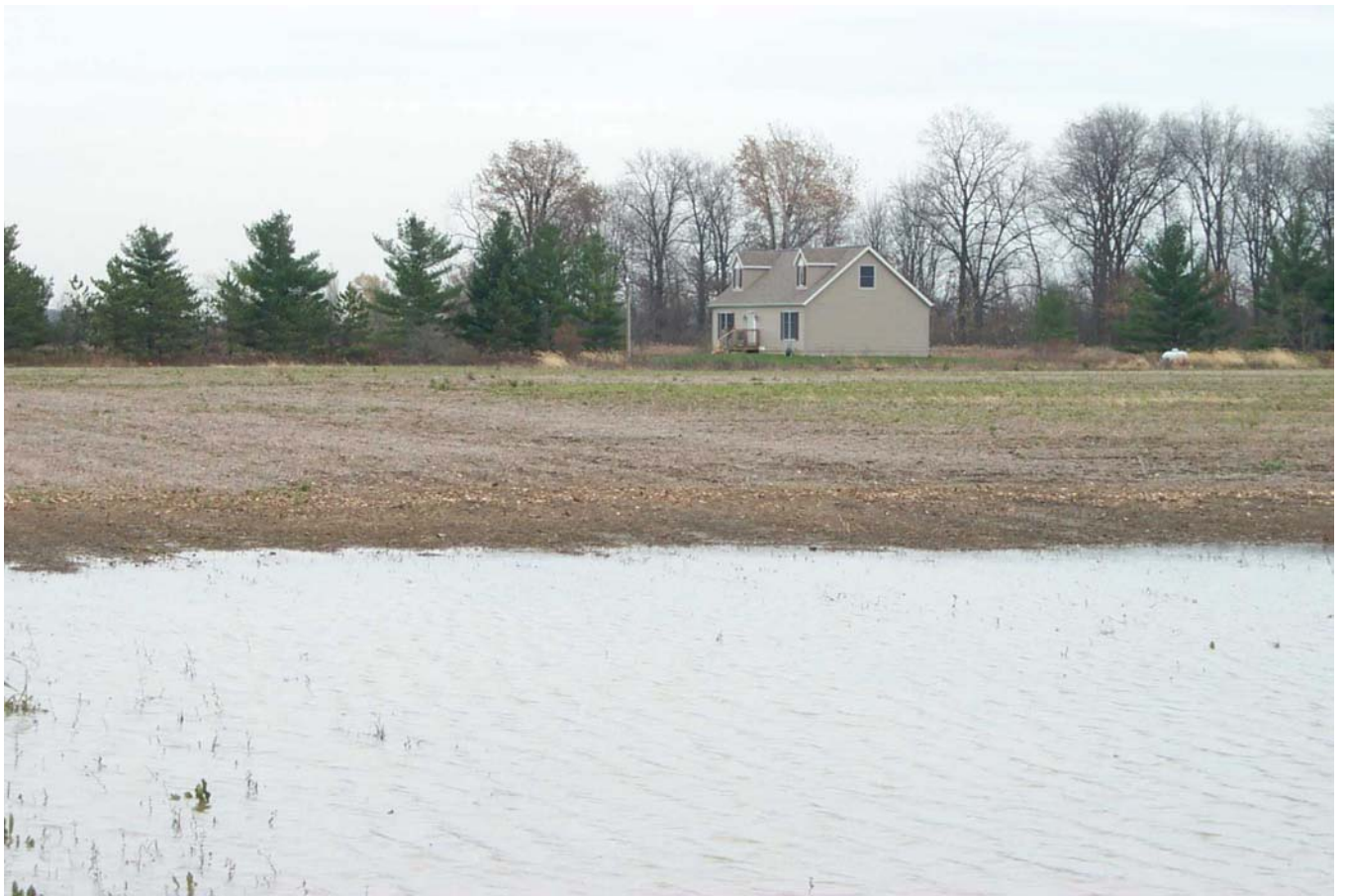
Figure 8.—Ponding after a heavy rain in an area of Treaty silty clay loam, 0 to 1 percent slopes.

subject to wetness. Unless these soils are artificially drained, wetness may damage crops or delay planting in most years.