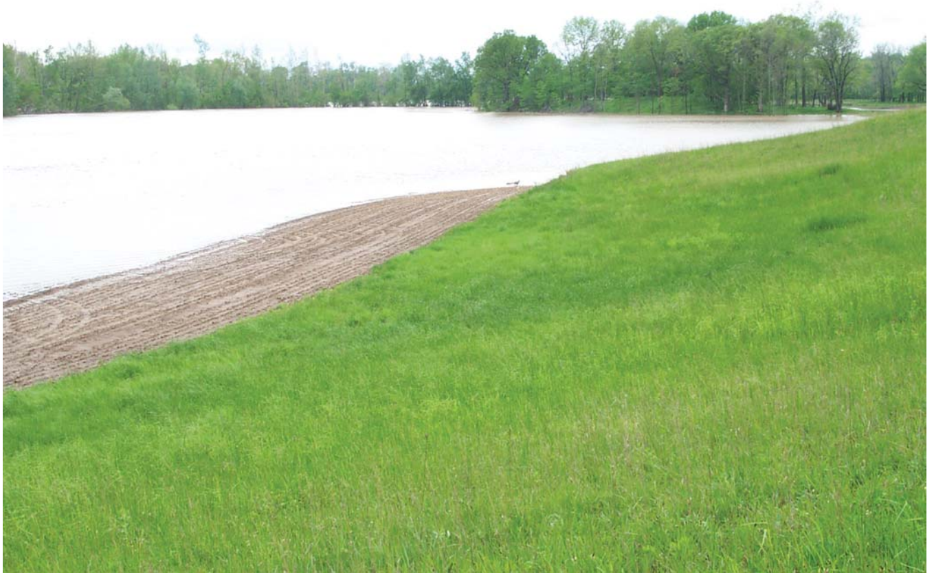
Figure 22.—Flooding in an area of Shoals silt loam, 0 to 2 percent slopes, frequently flooded, brief duration.

percent in any year); rare that it is unlikely but possible under unusual weather conditions (the chance of flooding is 1 to 5 percent in any year); occasional that it occurs infrequently under normal weather conditions (the chance of flooding is 5 to 50 percent in any year); frequent that it is likely to occur often under normal weather conditions (the chance of flooding is more than 50 percent in any year but is less than 50 percent in all months in any year); and very frequent that it is likely to occur very often under normal weather conditions (the chance of flooding is more than 50 percent in all months of any year).