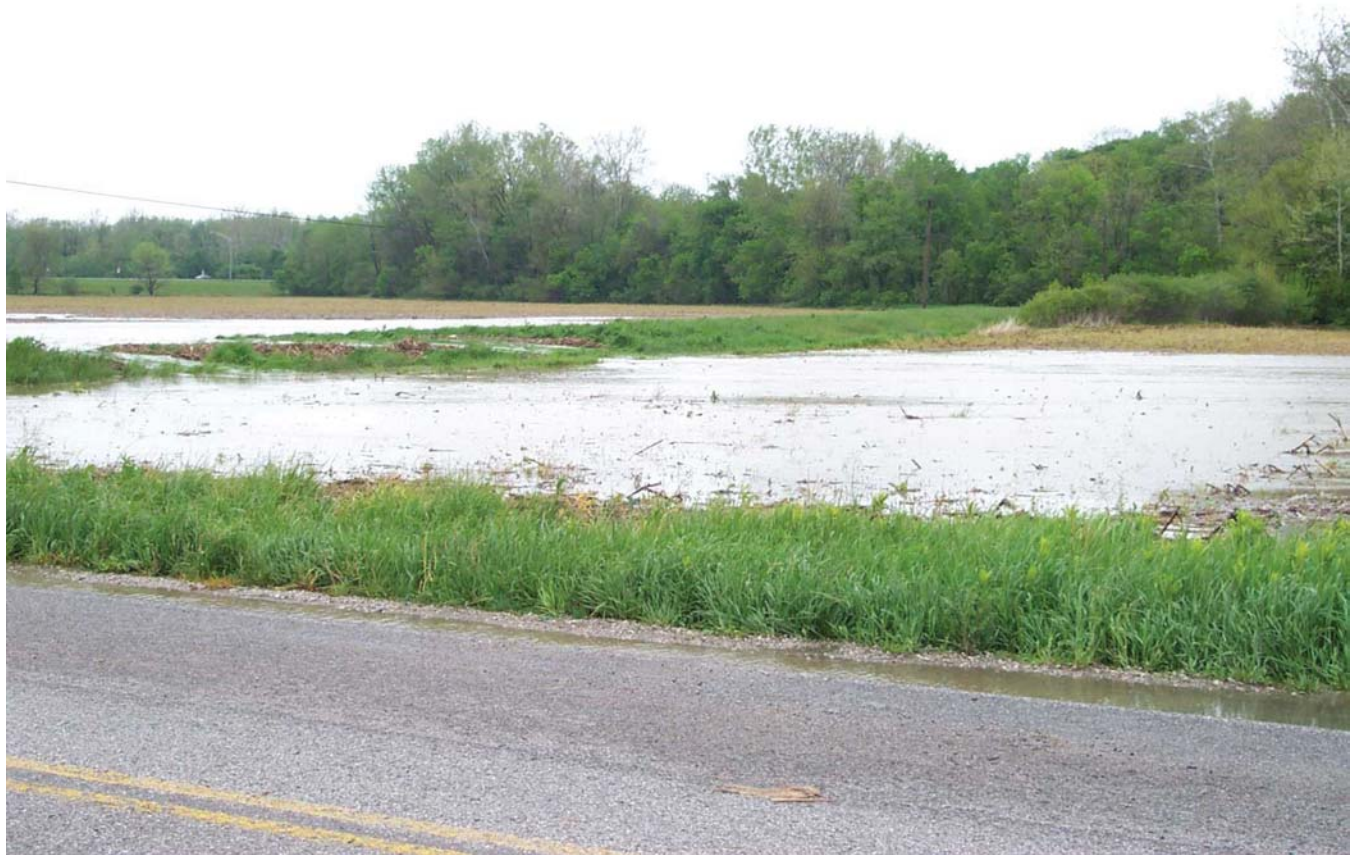
Figure 11.—Flooding in an area of Rossburg and Landes soils, 0 to 2 percent slopes, frequently flooded, brief duration, along Eagle Creek, south of Zionsville.

Flooding .—The soil is subject to occasional or frequent periods of flooding during the growing season.