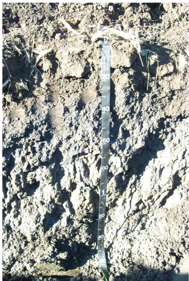
Figure 24.—Profile of Cyclone silty clay loam, 0 to 1 percent slopes.

Cyclone silty clay loam (fig. 24), on a slope of less than 1 percent in a cultivated field at an elevation of 920 feet above mean sea level; Clinton County, Indiana; about 3 miles east and 3 miles north of Kirklín; 1,750 feet east and 1,800 feet south of the northwest corner of sec. 27, T. 21 N., R. 2 E.; USGS Kirklín, Indiana, topographic quadrangle; lat. 40 degrees 14 minutes 20.5 seconds N. and long. 86 degrees 17 minutes 35 seconds W., NAD 27; UTM Zone 16, 560134 easting and 4454530 northing, NAD 83: