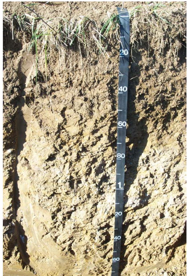
Figure 26.—Profile of Miami silt loam, 6 to 12 percent slopes, eroded.

2Bt2—13 to 23 inches; dark yellowish brown (10YR 4/4) clay loam; strong coarse subangular blocky structure; firm; many distinct brown (7.5YR 4/4) clay films on faces of peds and as linings of some