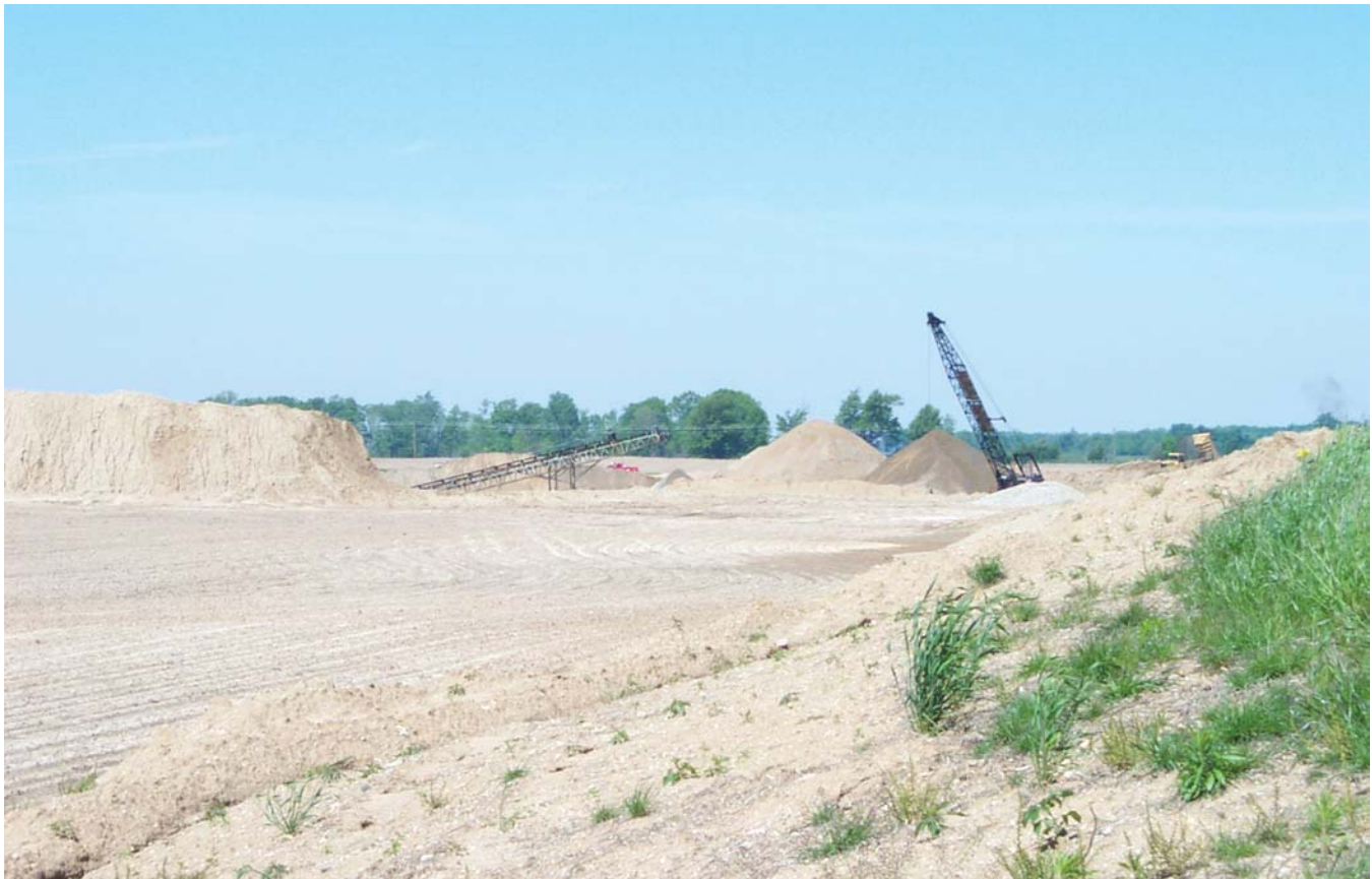
Figure 4.—Mining of sand and gravel in an area of Pits, sand and gravel.

Prime farmland status: Rodman and Rock outcrop—not prime farmland