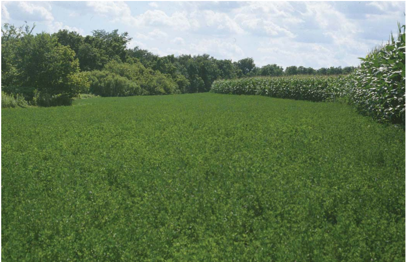
Figure 9.—A buffer strip in an area of Shoals silt loam, 0 to 2 percent slopes, occasionally flooded, very brief duration. Miami-Rainsville complex, 6 to 12 percent slopes, eroded, is in the area planted to corn.

Water- and sediment-control basins are effective in reducing the rate of runoff in drainageways. They are