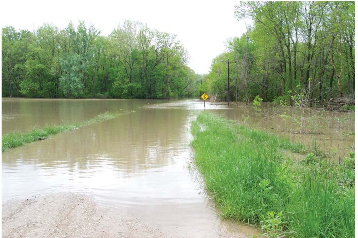
Figure 5.—Flooding in an area of Shoals silt loam, 0 to 2 percent slopes, frequently flooded, brief duration.