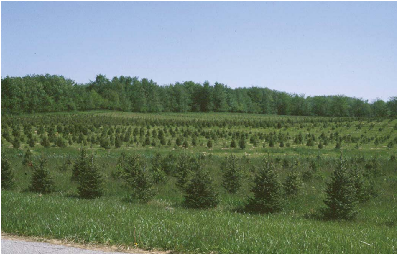
Figure 7.—Christmas tree farm in an area of Ockley silt loam, 2 to 6 percent slopes, eroded.

Wetness is a major management concern in areas of the naturally wet, poorly drained or very poorly drained Cyclone, Mahalaland, Mahalassville, Sloan, Southwest, Treaty, and Westland soils (fig. 8). Production of the crops commonly grown in the county is generally not practical on these soils unless a drainage system is installed. Somewhat poorly soils, such as Crosby, Fincastle, and Starks soils, also are