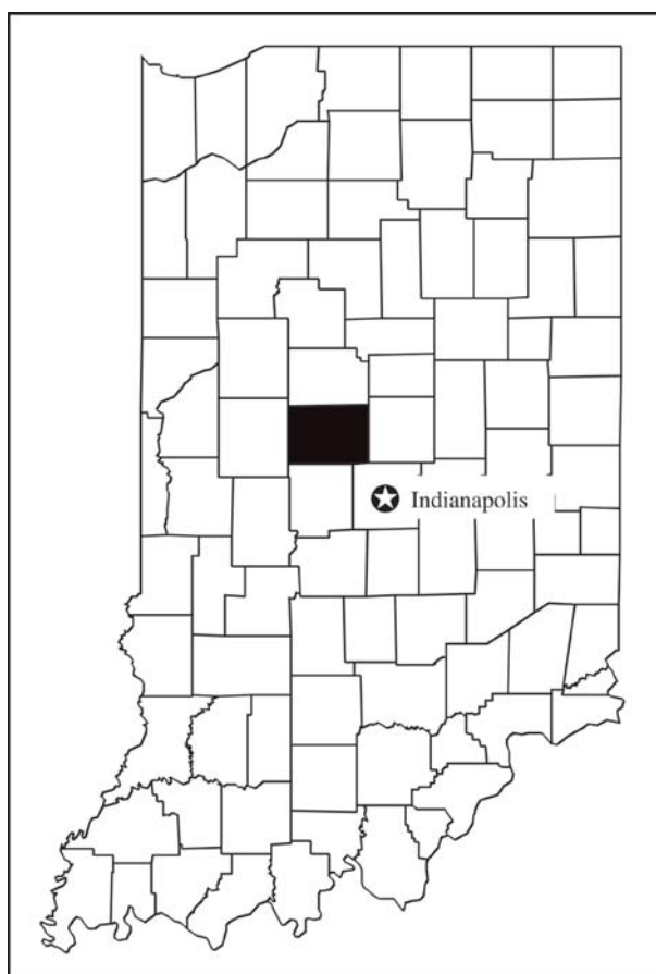
Figure 1.—Location of Boone County in Indiana.

This soil survey updates and refines the soil survey of Boone County published in 1975 (Langlois, 1975). It