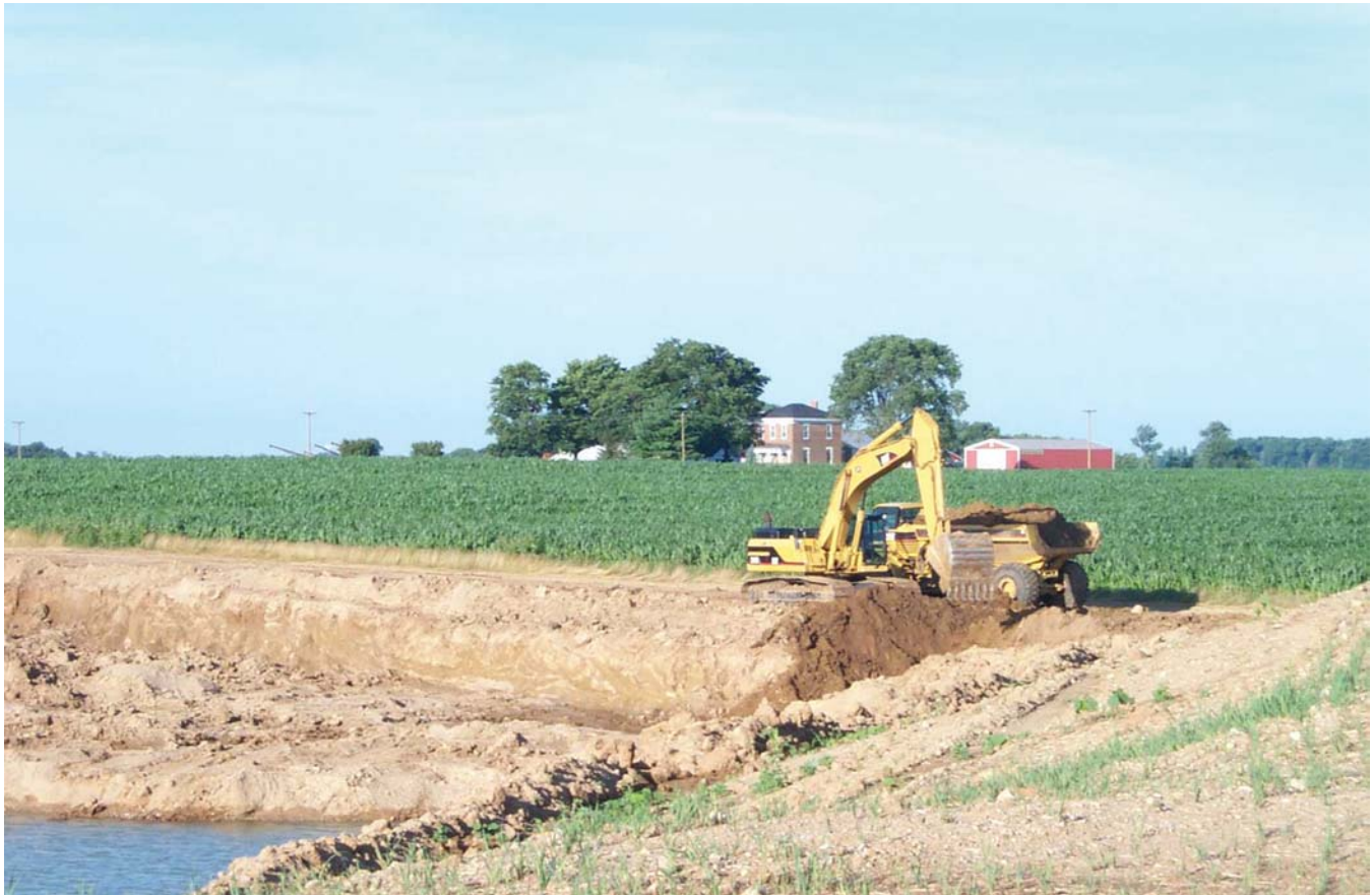
Figure 20.—A new gravel pit in an area of Wawaka silt loam, 0 to 2 percent slopes.

Topsoil is used to cover an area so that vegetation can be established and maintained. The upper 40 inches of a soil is evaluated for use as topsoil. Also evaluated is the reclamation potential of the borrow area. The ratings are based on the soil properties that affect plant growth; the ease of excavating, loading,