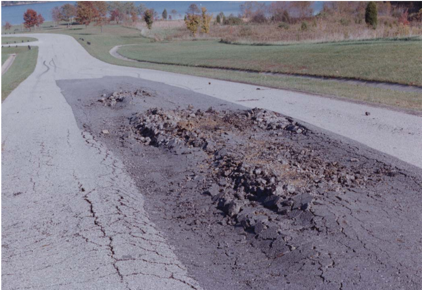
Figure 17.—A road damaged by frost heave.

Shallow excavations are trenches or holes dug to a maximum depth of 5 or 6 feet for graves, utility lines, open ditches, or other purposes. The ratings are based on the soil properties that influence the ease of digging and the resistance to sloughing (caving of