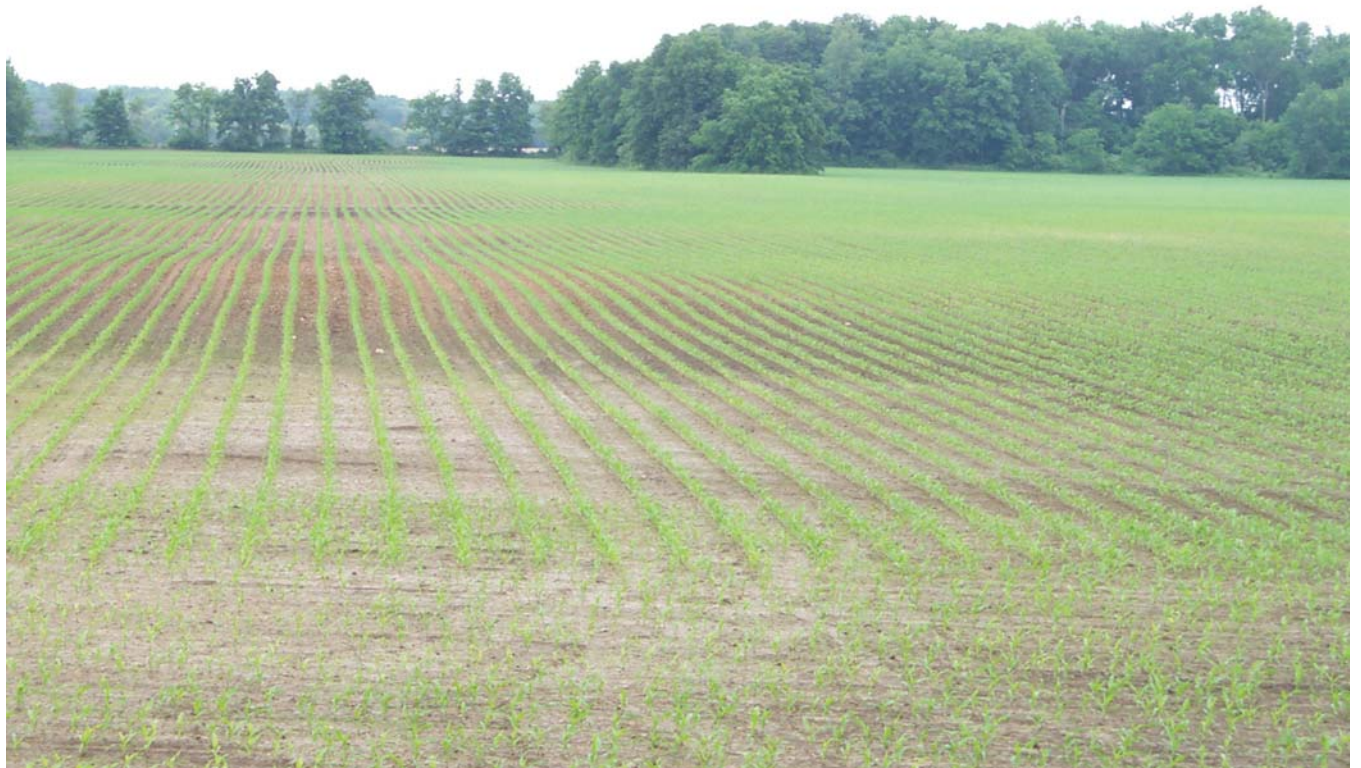
Figure 6.—Corn planted in an area of Whitaker silt loam, 0 to 2 percent slopes.

Available water capacity: About 11.4 inches to a depth of 60 inches