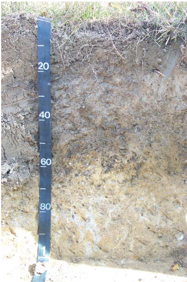
Figure 23.—Profile of Crosby silt loam, 0 to 2 percent slopes.

matrix; many medium distinct gray (10YR 6/1) iron depletions in the matrix; 2 percent rock fragments; strongly acid; clear smooth boundary.