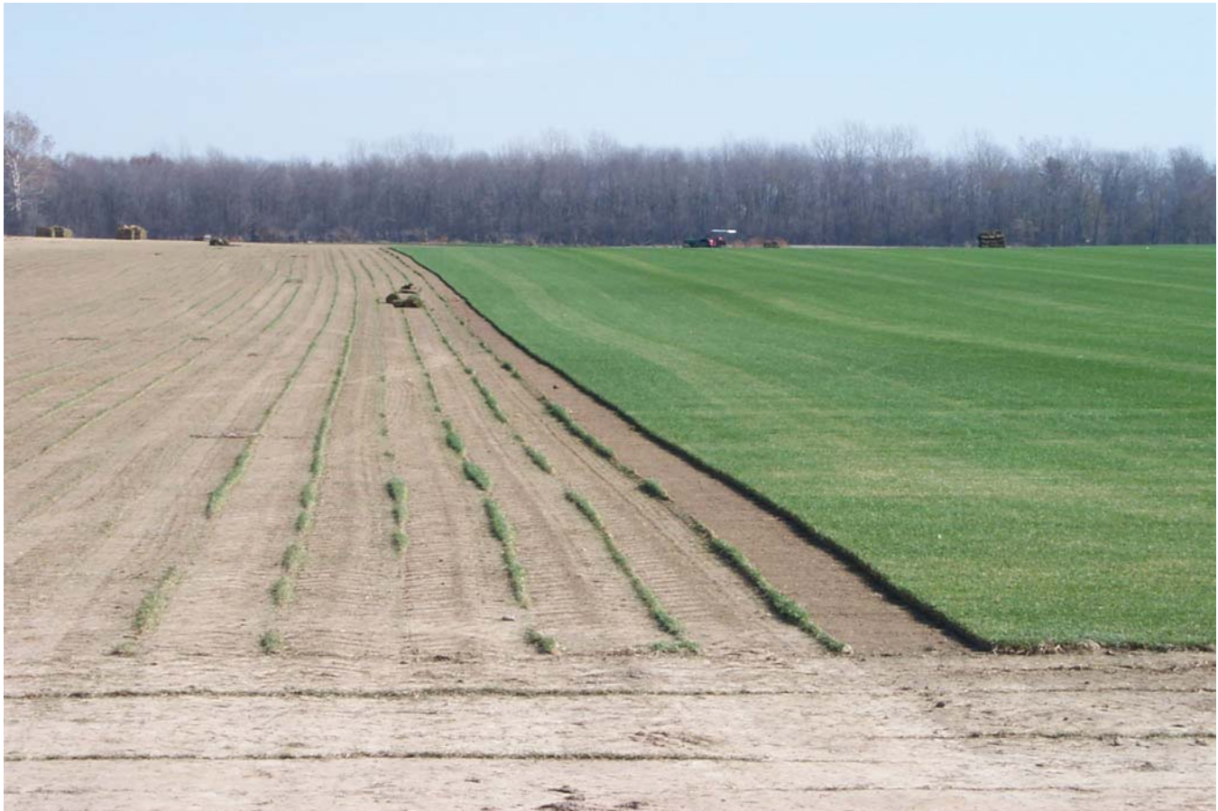
Figure 3.—Sod farm in an area of Fincastle silt loam, 0 to 2 percent slopes.