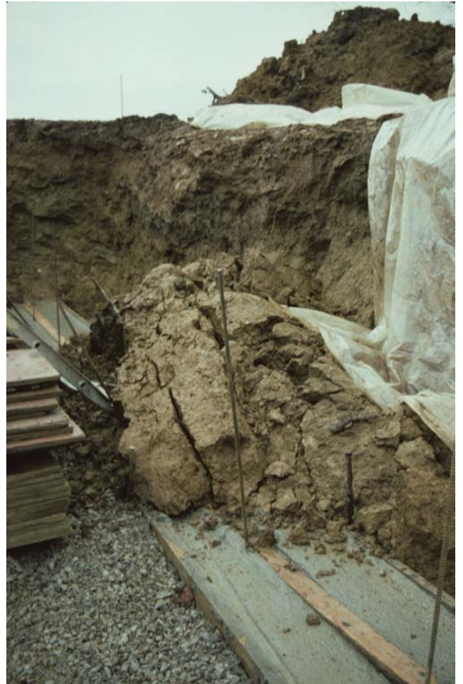
Figure 18.—Caving of a basement excavation.

Numerical ratings in the tables indicate the severity of individual limitations. The ratings are shown as decimal fractions ranging from 0.01 to 1.00. They indicate gradations between the point at which a soil feature has the greatest negative impact on the use