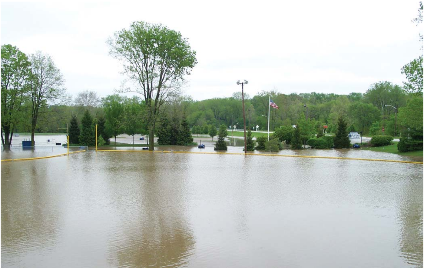
Figure 15.—Flooding in an area of Rossburg and Landes soils, 0 to 2 percent slopes, frequently flooded, brief duration, in Zionsville Park.

heavy foot traffic, and not be dusty when dry. The soil properties that influence trafficability are texture of the surface layer, depth to a water table, ponding, flooding, permeability, and large stones. The soil properties that affect the growth of plants are depth to bedrock or a fragipan (referred to as a cemented pan in the tables), permeability, and toxic substances in the soil.