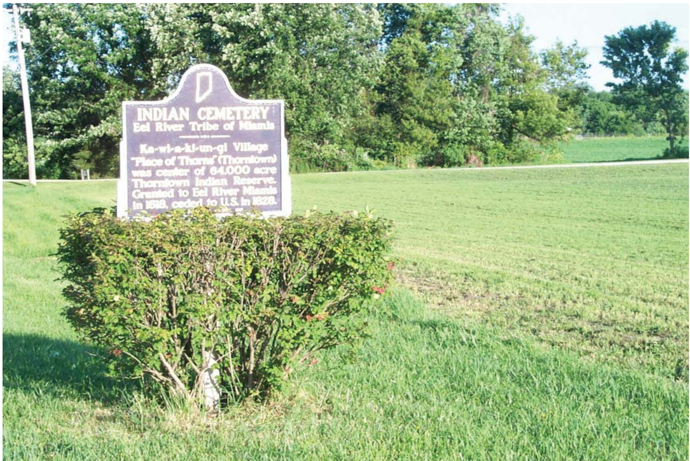
Figure 2.—Historic site in Boone County.

Boone County is located entirely on the Tipton Till Plain. This plain is the largest physiographic region in Indiana. It covers approximately 11,900 square miles, or nearly one-third of the State. The plain generally is a slightly modified ground moraine. It is a level and nearly featureless plain marked only by numerous low and inconspicuous morainic ridges (Malott, 1922). There is a significant topographic ridge trending southwest through the center of Boone County. This ridge marks the division between the Wabash River watershed to the west and the White River watershed to the east. The end moraines generally trend to the