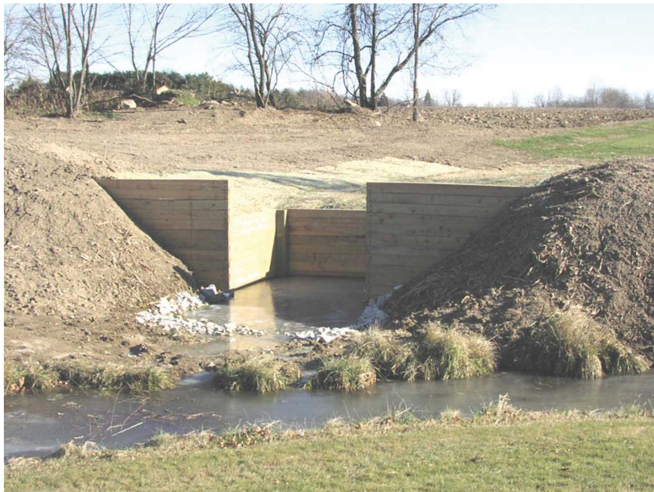
Figure 10.—Wooden drop box structure in an area of Miami clay loam, 6 to 12 percent slopes, severely eroded.

most effective where subsurface tile can be installed as an outlet and on soils that have slopes of about 8 percent or less. Miami and Williamstown soils are examples.