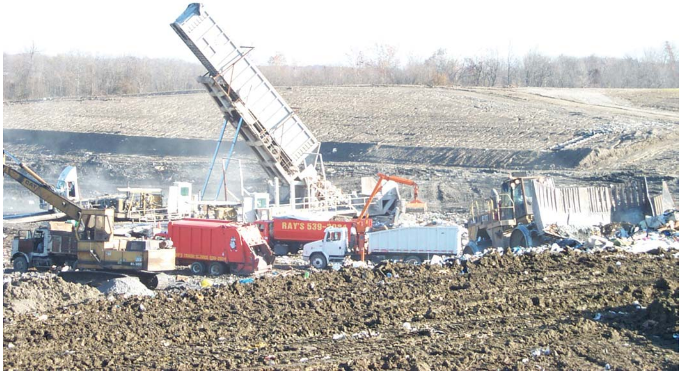
Figure 19.—A sanitary landfill in an area of Udorthents, rubbish.

sanitary landfill. The soil material is obtained offsite, transported to the landfill, and spread over the waste. The ratings in the table also apply to the final cover for a landfill. They are based on the soil properties that affect workability, the ease of digging, and the ease of moving and spreading the material over the refuse daily during wet and dry periods. These properties include soil texture, depth to a water table, ponding, rock fragments, slope, depth to bedrock or a fragipan (referred to as a cemented pan in the tables), reaction, and content of salts, sodium, or lime.