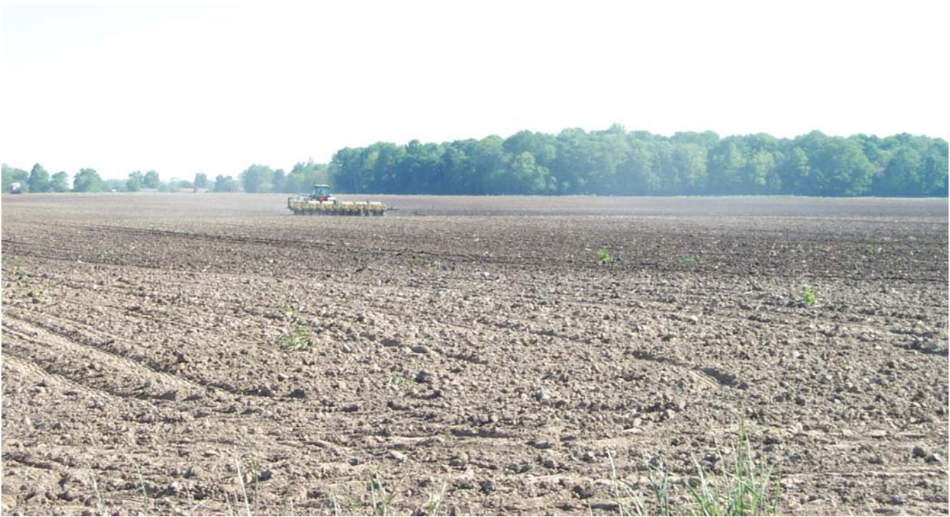
Figure 13.—Planting corn in an area of Crosby silt loam, 0 to 2 percent slopes, and Treaty silty clay loam, 0 to 1 percent slopes. Where drained, these soils are considered prime farmland.