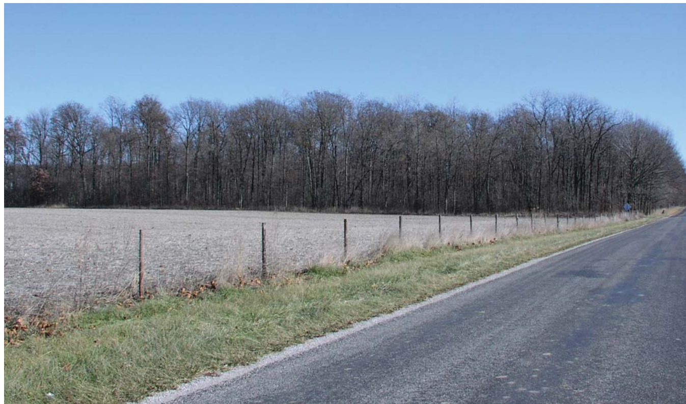
Figure 14.—Mixed hardwood forest in an area of Fincastle and Treaty soils.

Much of the existing commercial forestland in Boone County can be improved by thinning out mature trees and undesirable species. Protection from grazing and fire and control of disease and insects also can improve the stands. The Natural Resources Conservation Service, the State Division of Forestry, consulting foresters, or the Cooperative Extension Service can help to determine specific woodland management needs. Assistance in establishing, improving, or managing forestland is available from foresters or natural resources specialists.