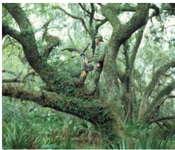
Blackbeard Island archery hunter