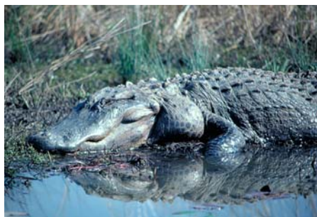
David E. Goeke

Savannah NWR is located on SC-170, six miles south of Hardeeville, South Carolina via US-17 (Exit 5 off I-95), or one mile north of Port Wentworth, Georgia on GA-25/SC-170 (take I-95 Exit 109 to GA-21 South, then east on GA-30 to GA-25 North.)