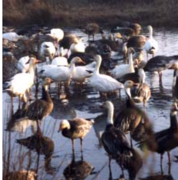
Watch geese from the Blue Goose Observation Tower in the morning hours throughout the winter.