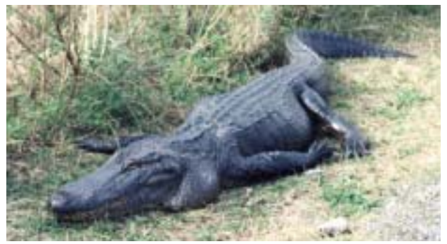
Alligator Alley is a good place to observe alligators during the spring and fall.