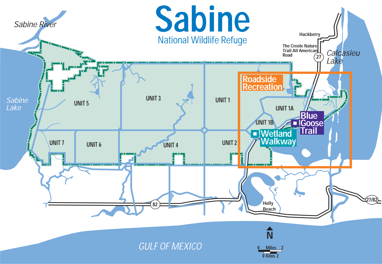
See Roadside Recreation Map, Blue Goose Trail Map and Wetland Walkway Map