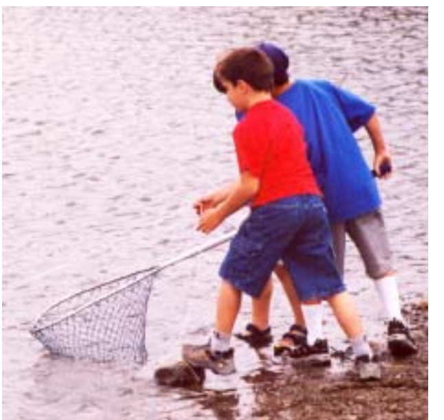
Crabbing is one of the most popular visitor activities on Sabine NWR.