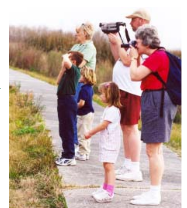
Visitors make memories with their children watching wildlife.