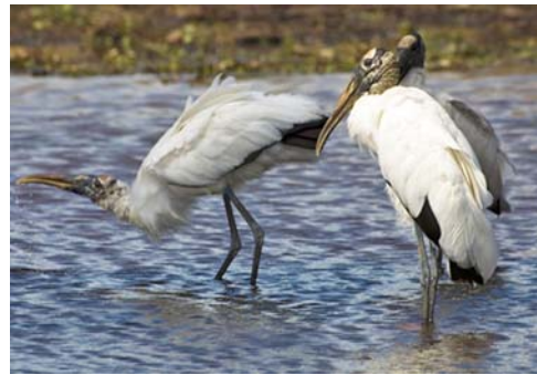
Left to right: woodstorks, tri-colored heron, West Indian manatee and calf, raccoon, oystercatcher, swallow-tailed kites, dolphin and white pelicans, all USFWS/ Larry Richardson.

As times have changed, the importance of the refuge increases with the pressure of growing cities which continue to change the landscape. The need to preserve and set aside natural areas for our nation's wildlife serves to protect our ecological systems as well as to provide beautiful areas for recreation and wildlife observation.