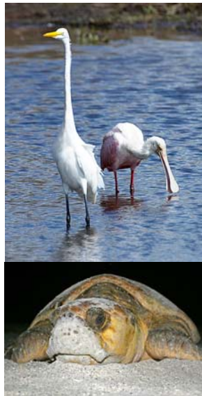
Above: white egret and spoonbill; below: loggerhead sea turtle

A maze of mangrove islands and narrow waterways serve as the nursery for many plants, animals and fish and define the area known as Ten Thousand Islands National Wildlife Refuge. The 35,000-acre refuge provides vital habitat for all kinds of protected plants and animals. Nearly 200 fish species have been documented in the waters, which are also home to several endangered species including the West Indian manatee, Snail Kite, Peregrine Falcon, Wood Stork, and the Atlantic loggerhead, green, and Kemp's Ridley sea turtles. Many of the nearly 200 species of birds that use the refuge are migratory, and use the mangrove islands to protect them from storms, as feeding grounds, and to simply rest during their long migrations. Throughout the year, visitors can expect to see herons and egrets, manatees, raccoon, river otters, and bottle-nosed dolphins.