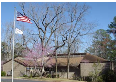
Piedmont National Wildlife Refuge Visitor Center; open 8 am - 5 pm weekdays