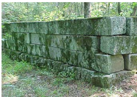
Granite enclosure surrounding Unnamed Cemetery #11