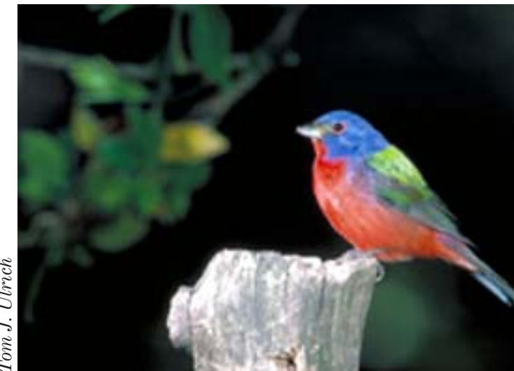
Tom J. Ulrich

(905 acres), mixed hardwood/pine forest (663 acres), man-made freshwater ponds (157 acres), and forested wetland (two acres). Management of six man-made freshwater impoundments enhances the refuge’s importance as a wintering area for migratory birds. These ponds also serve as an important rookery site for the endangered wood stork, as well as roosting and feeding areas for many other wading birds and waterfowl.