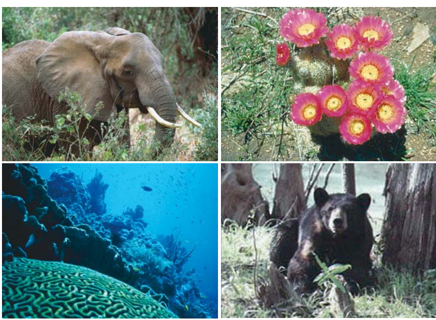
African elephant USFWS Coral Reef USFWS