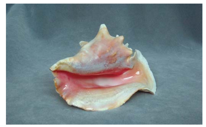
Lynx USFWS Green Sea Turtle USFWS Queen Conch Shell USFWS