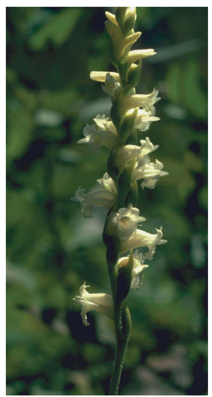
Ladies Tresses Orchid USFWS