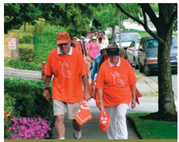
Group walks around Kirkland's neighborhoods promote exercise and minimize social isolation for older adults.

The city of Kirkland, Wash., strives to make its physical activities more accessible for its 19,000 older residents by organizing exercise opportunities and improving infrastructure.