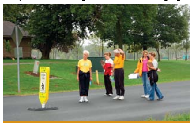
Members of the city of Victoria Senior Commission and other community members conduct a walking audit as part of a Walkability Workshop.

principles into a Master Plan on Aging. Elected officials, key stakeholders and residents served on a county-wide Senior Commission to develop the master plan. In response, the Carver County Board of Commissioners adopted a "Communities for a Lifetime" vision statement in 2006 and in 2007 created the Office of Aging, housing it in the county's Public Health Division.