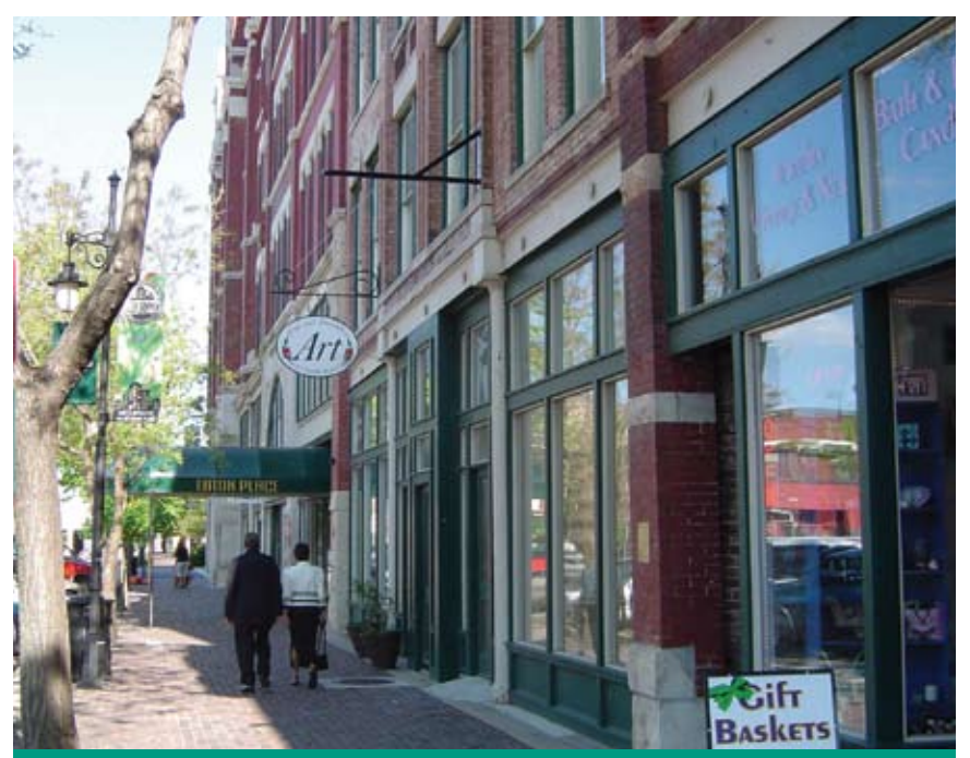
Smooth, flat surfaces promote walkability and prevent falls. Photo of Old Town Wichita, Kan., courtesy of Carlton Eley.

communities can enable residents to move within their neighborhood as their housing needs change. Such life-long residents help to establish a strong sense of place within a community. The benefits of building healthy communities for active aging are being realized in communities across the country. For example, the city of Saratoga Springs, N.Y., where 18 percent of the population is over 60 years of age, has created a mix of housing opportunities near the Saratoga Senior Center and medical facilities.