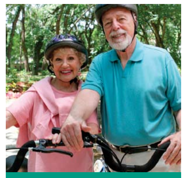
Physical activities, such as biking, can improve the quality of life for older adults.