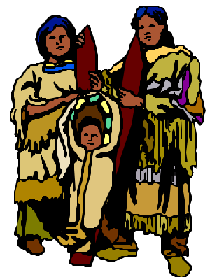
The symptomatic person is dependent on others to achieve a lost closeness.

Given the co-morbid physiologic and psychological concomitants of Bulimia Nervosa, it is obvious that the resurgence of this eating disorder is becoming a major public