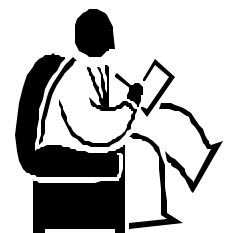
Differential Diagnostic Evaluation is part of quality care.