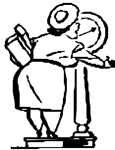
Sociocultural influences on eating behavior or concepts of an ideal body image is a factor.

view of the literature underscores the complexity of a clear link between the childhood sexual abuse (CSA) and later development of Bulimia Nervosa (BN). The inclusion of clinical knowledge shows that substance abuse, emotional abuse, adverse family background, and sexual abuse