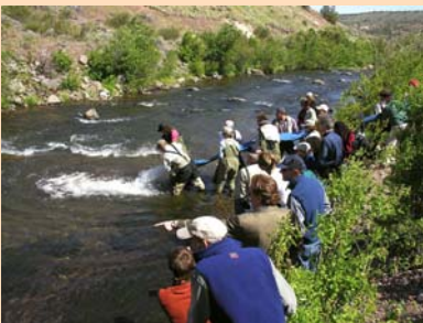
The consultation group on Biological Diversity tours Warm Springs Hatchery and assists in releasing Chinook salmon into Shitike Creek, a historical site for this species.