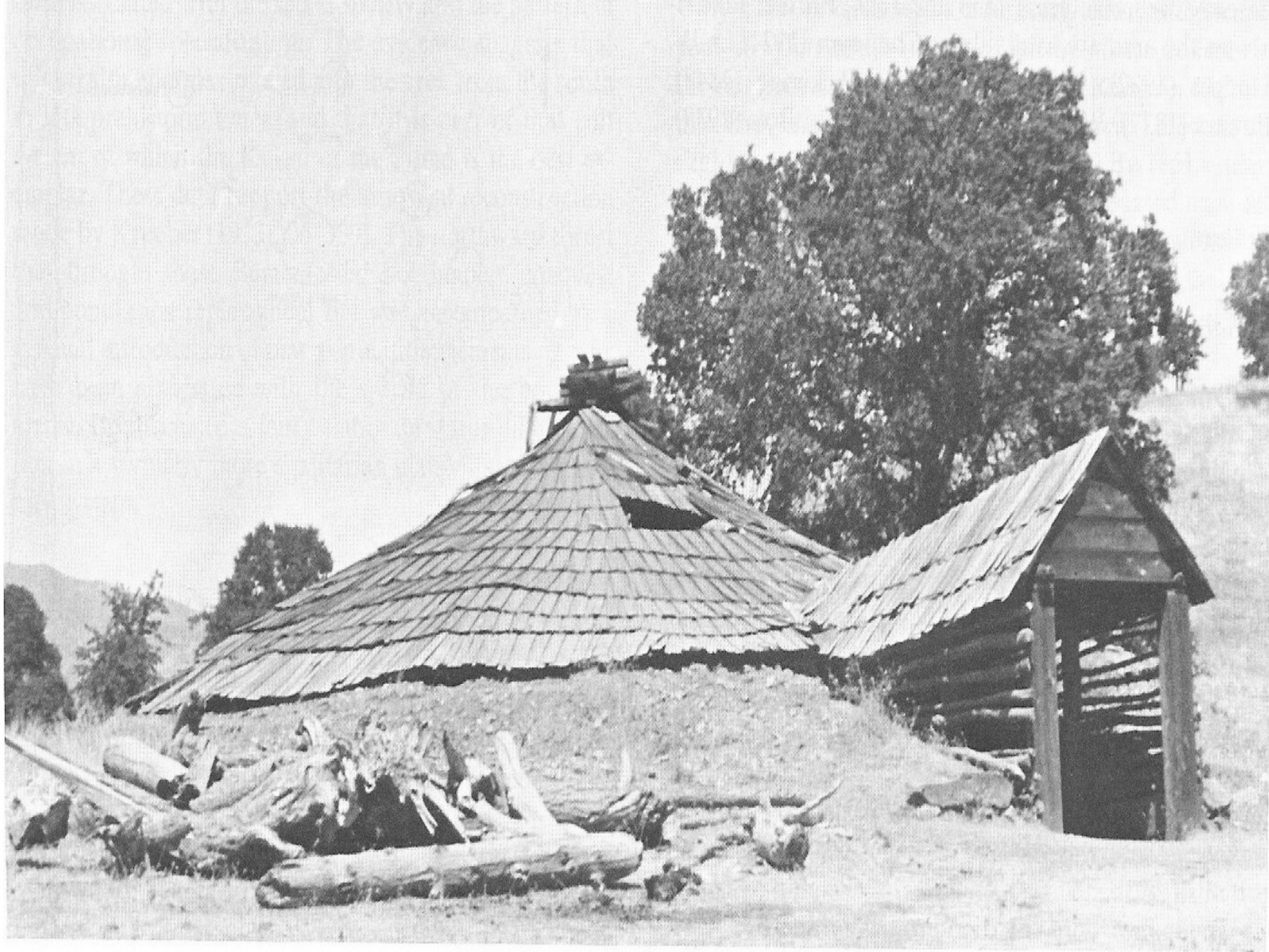
Fig. 3. A semisubterranean dance house at Paskenta. Photograph by Walter Goldschmidt, 1938.