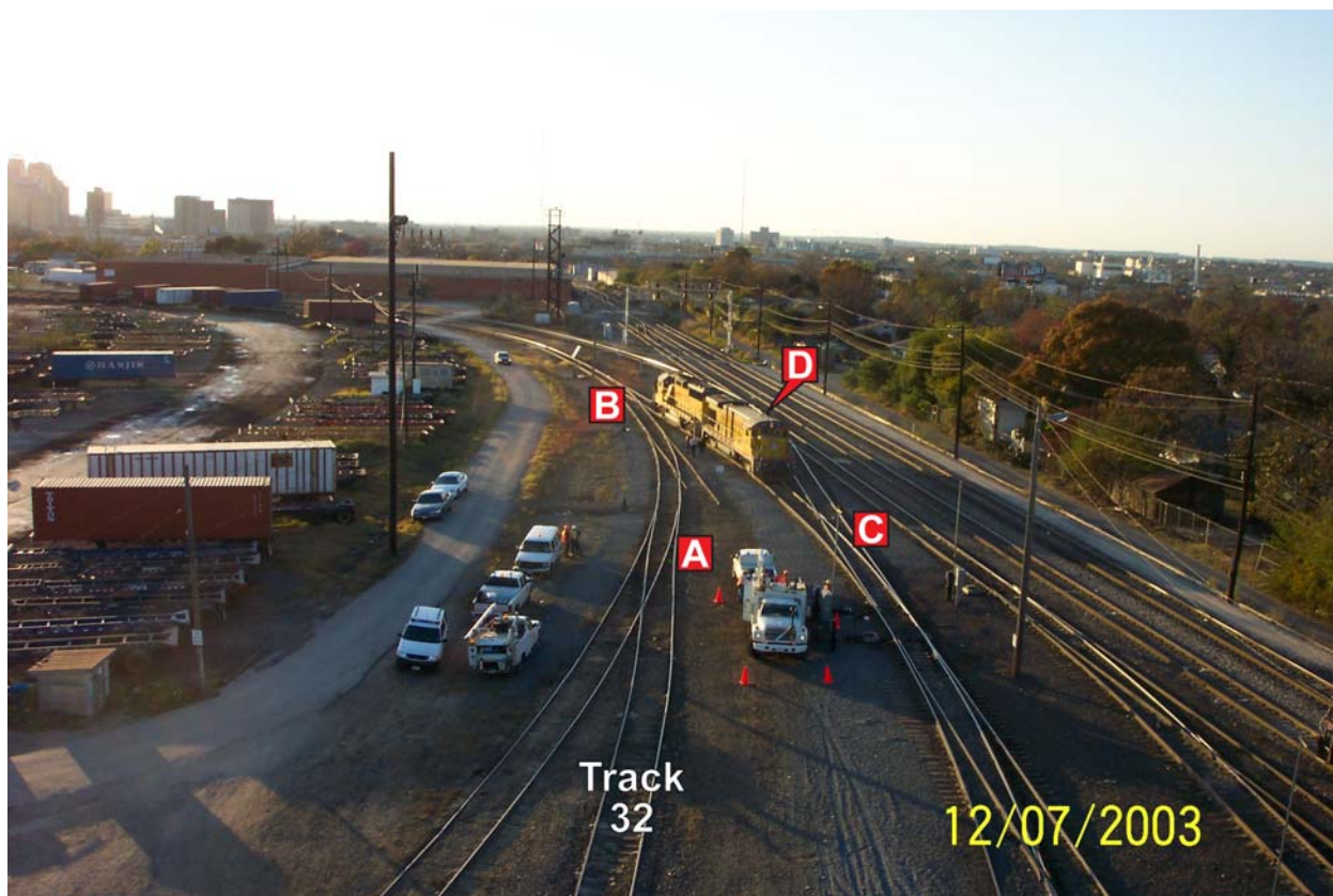
Figure 2. Exemplar locomotives are shown near postaccident point-of-rest location. (Letters A, B, C, and D indicate switches.)

The wheel yard lead to the train yard lead east crossover switch (C) was found aligned toward the inner loop. For the locomotives to reach the train yard lead and the train yard track 3, switch C should have been aligned in the other direction.