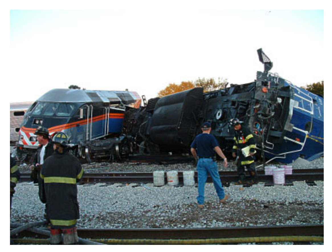
Figure 2. The lead locomotive (on its side) and second locomotive at their final resting positions.

automatically as the train derailed. The locomotives and cars separated. Both locomotives and all five of the passenger cars derailed, striking a Metra passenger-equipment wash building on track 6 at Metra's 47th Street Yard. The lead locomotive overturned onto its right side, facing south. The trailing locomotive derailed upright, facing north adjacent to the lead locomotive. The derailed passenger cars remained upright and parallel to the track structure. (See figure 2 for a photograph of the derailed locomotives and figure 3 for a photograph of the derailed passenger cars.)