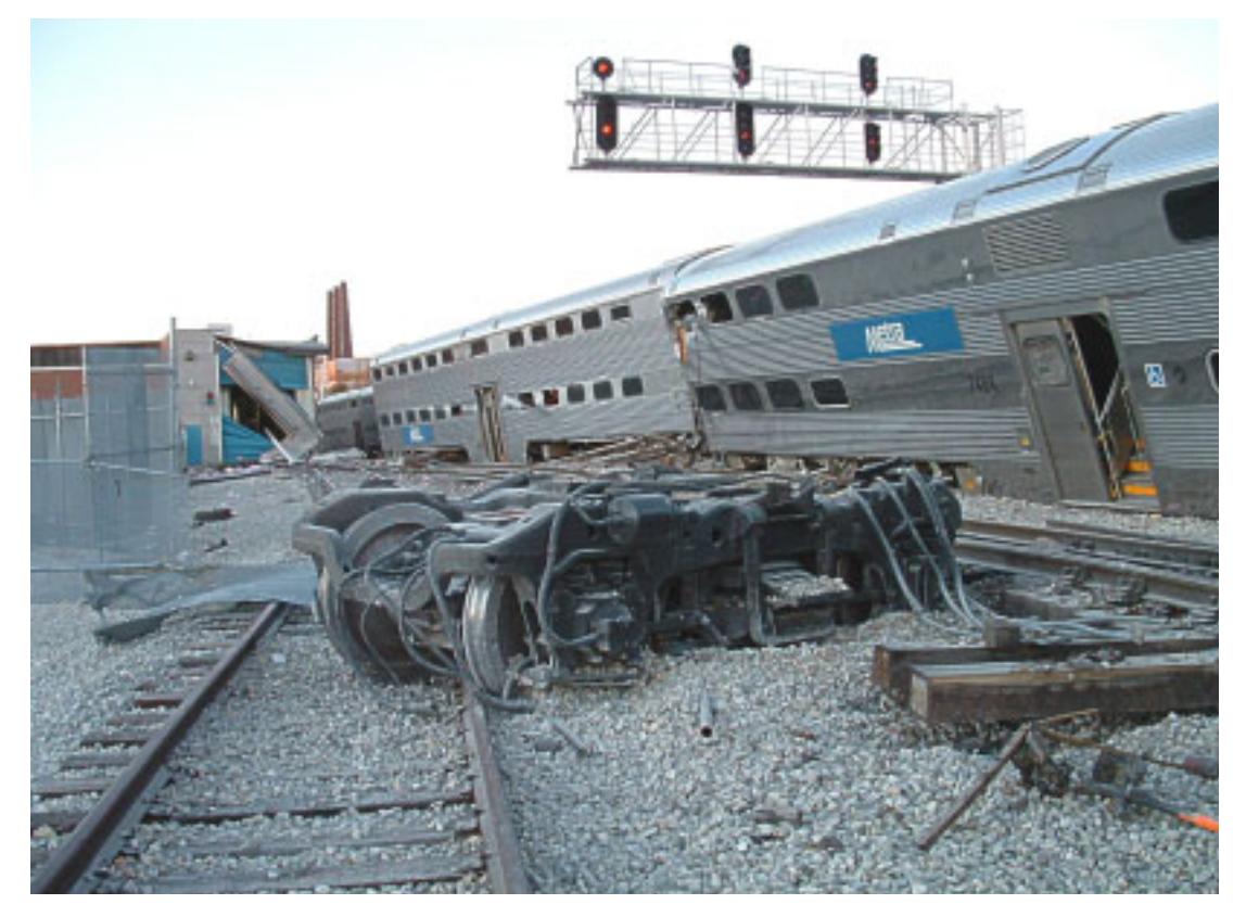
Figure 3. All five passenger cars derailed but remained upright. The trucks from the lead locomotive dislodged (foreground).

locomotive, and a hazardous materials support unit was called because of a locomotive fuel tank leak. Nineteen ambulances would eventually respond to the scene. Passengers were already getting off the derailed coaches when the first units arrived. The train's locomotives and cars were searched and evacuated. Between 40 and 45 people were transported from the scene by ambulance. The remaining passengers were transported by bus from the scene. A command post was established to the west of the incident. Emergency responders remained on scene until 8:00 p.m.