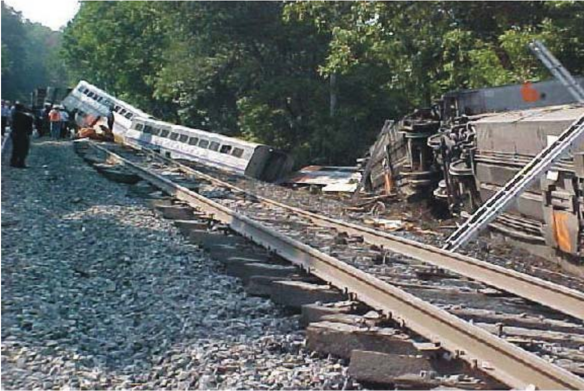
Figure 2. View of wreckage looking south.

handle in emergency. The train's locomotives came to a stop about 400 feet beyond the point of the emergency brake application.