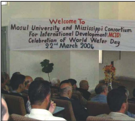
Mississippi Consortium for International Development (MCID) and University of Mosul World Water Day Celebration

We hope you find the information in this book useful in pursuing business opportunities with USAID. For additional information, visit USAID's website at www.usaid.gov .