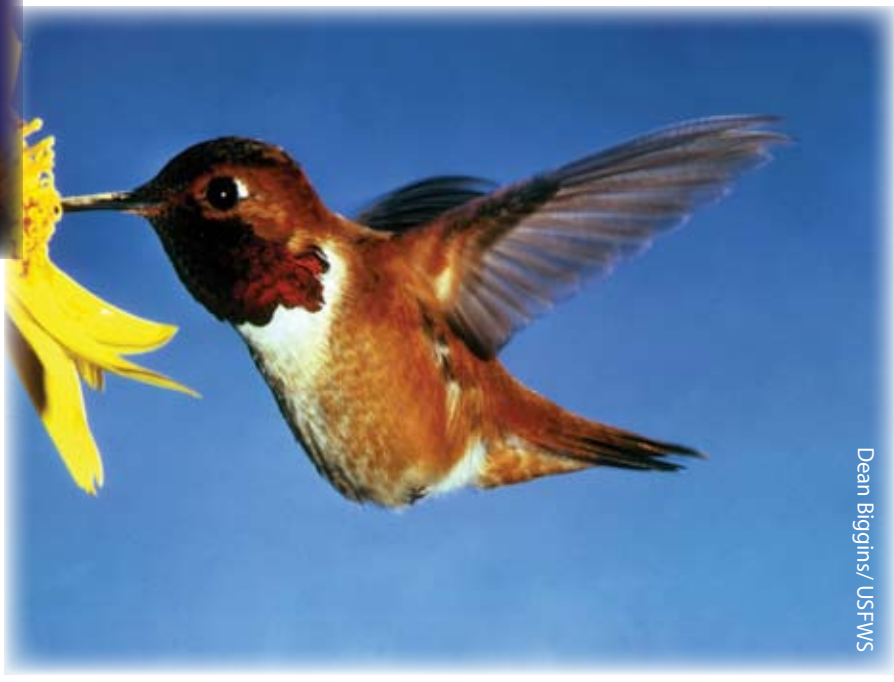
HELP! Rufous has lost his way. Can you help the humminbird find its way to the flowers on the catus?

The Rufous hummingbird makes one of the longest migratory journeys of any bird in the world, as measured by body size. Its 3,900 mile journey from Mexico to Alaska is equal to 784,500 body lengths!