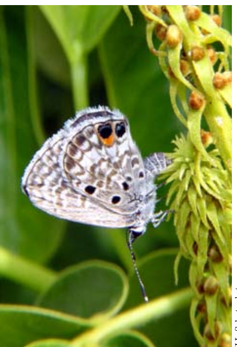
Miami blue butterfly, a species that is a candidate for listing as endangered.

Because of the number of candidates and the time required to list a species, we developed a priority system designed to direct our efforts toward the plants and animals in the greatest need. In our priority system, the degree or magnitude of threat