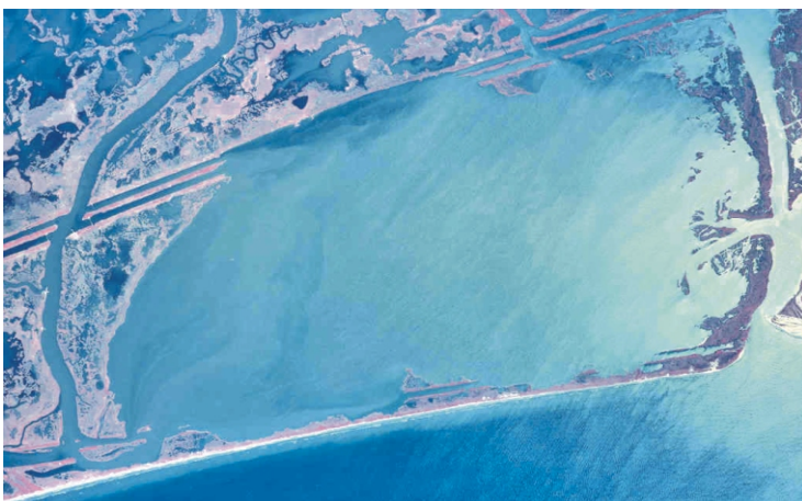
This infrared aerial view of the project area was taken in 2000. The remaining barrier shoreline is in jeopardy of breaching with the next hurricane passage.

This project was selected for Phase I (engineering and design) funding at the January 2002 Breaux Act Task Force meeting. It is included as part of Priority Project List 11.