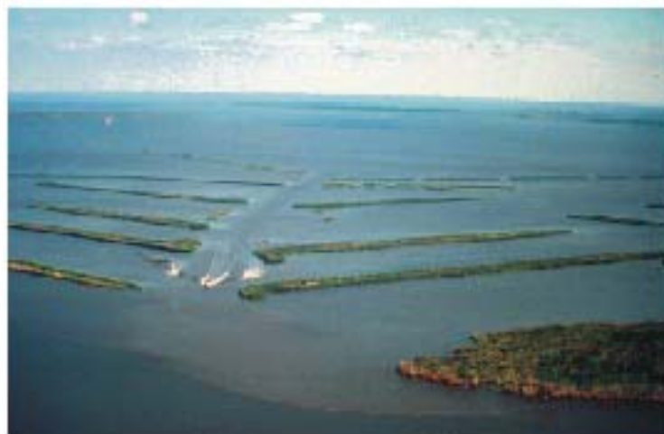
Aerial photo of constructed terraces in Little Vermilion Bay.

In 1998 alone (prior to the project's completion) 40 acres of wetland habitat were created.