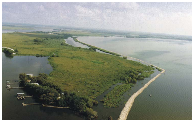
Phase 2 of the Lake Salvador restoration project. The rock structure shown was installed to help stabilize the shoreline, allow sediment trapping, and promote marsh development.

For more project information, please contact: