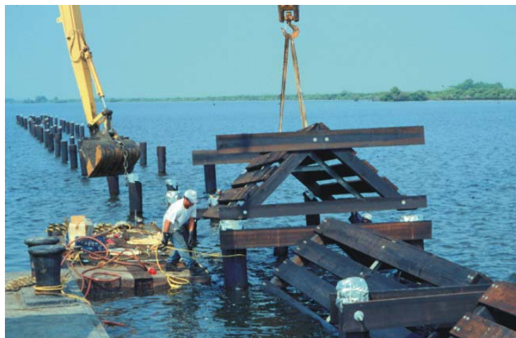
Installation of an erosion control structure during Phase 1 of the Lake Salvador restoration project.

The phase 2 structure (rock) has successfully reduced the shoreline erosion rate. Monitoring has indicated not only a halt in erosion, but a shoreline gain of 1.8 feet per year. This project is on Priority Project List 3.