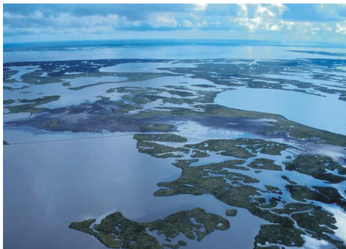
An aerial close-up view of the created wetlands with a prominent lobe in the foreground.

Existing canal networks that extend into the center of Point Au Fer Island have considerably altered its hydrology. Specifically, excessive tidal water exchange has increased erosion, creating a 30% loss of the island's interior marsh over the past 60-70 years.