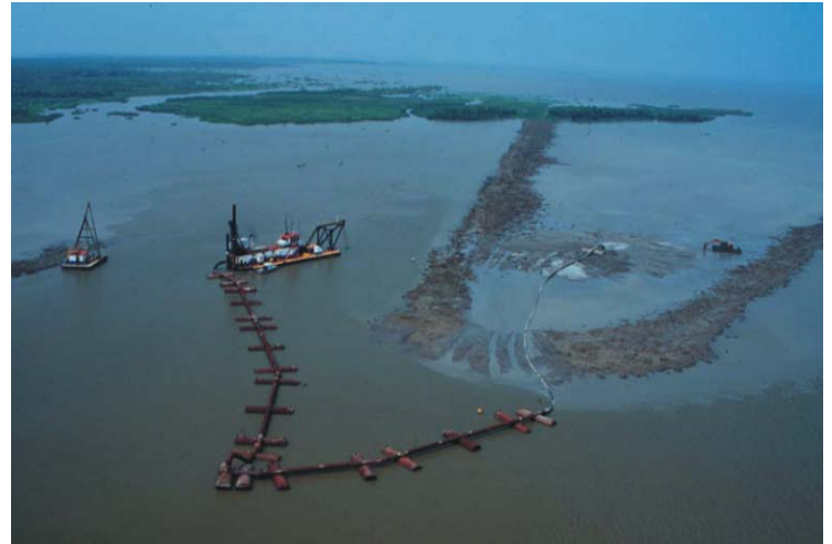
A hydraulic dredge pumps sediment to create new wetland habitat in the project area south of Morgan City.

The project was an opportunity to increase marsh habitat in the northwestern portion of the Atchafalaya Delta. In 1998, over 3.4 million cubic yards of sediment north of Big Island were dredged to create several distributary channels that reestablished water and sediment flows into shallow water areas in the delta. The sediment was strategically placed to mimic natural delta lobe formation at an elevation suitable for marsh growth. Over 922 acres of new habitat were directly created by construction, and the reestablished water and sediment flows are expected to add an additional 2,000 acres over the life of the project.