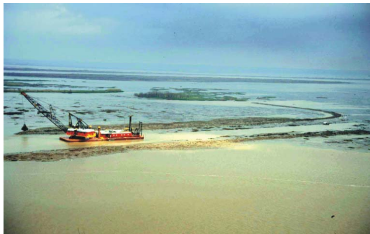
A bucket dredge is shown removing sediment from a shoaled-in channel in order to help reestablish water and sediment flow within the Atchafalaya Delta.

The purpose of this project is to promote natural delta development by reopening two silted-in channels and using those dredged sediments to create new wetlands. Approximately 720,000 cubic yards of sediment were dredged from Natal Channel and Castille Pass in 1998. Over 12,000 feet of channel were reopened, and more than 280 acres of new habitat were created by the strategic placement of the dredged channels' sediments. By reestablishing water and sediment flow into the eastern part of the Atchafalaya Delta, an additional 1,200 acres of new habitat are expected to be naturally created over the life of the project.