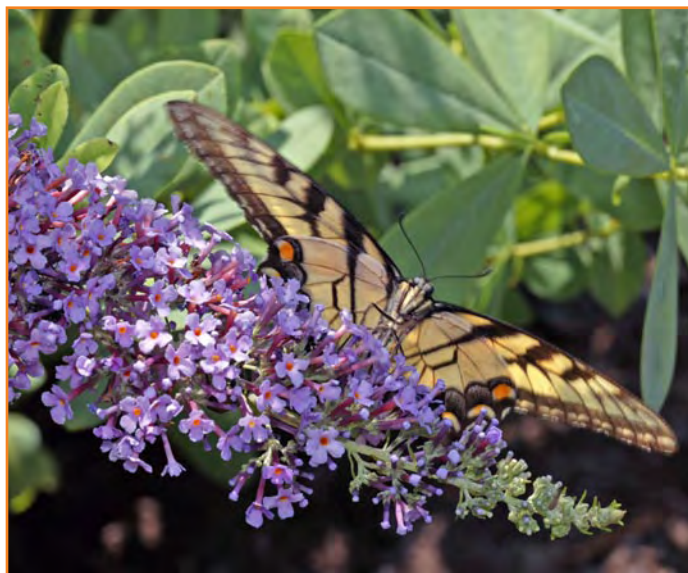
An Eastern Tiger Swallowtail butterfly drops by the garden to visit the butterfly bush blossoming with purple flowers.

"It's been very rewarding watching it grow," Schmidt said. ●