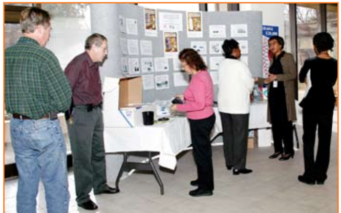
PPPL'ers stop by the Lab's recycling display during the America Recycles Day event in the LSB Lobby.

we have to improve in this area.” She added, “Thanks to all PPPL staff for their continual support and efforts in recycling and buying recycled content products!” ●