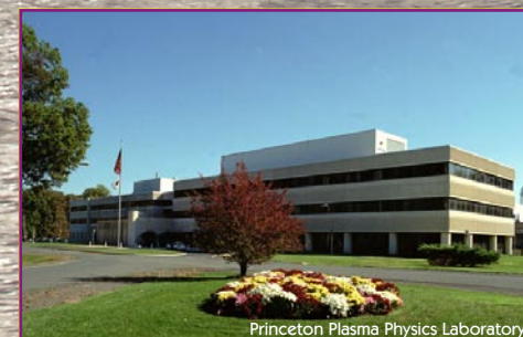
Princeton Plasma Physics Laboratory

CANCELLATIONS: If it is necessary to cancel a session due to snow or ice storms, a message will be left on the Science-on-Saturday Hotline.