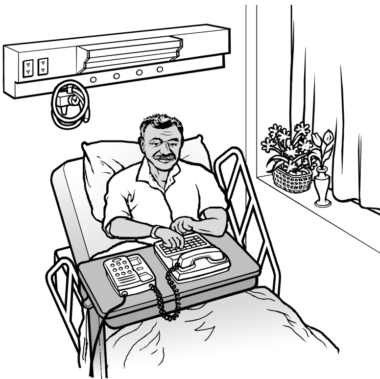
A hospital patient uses a TTY in his hospital room.

A hospital need not provide communication aids or services if doing so would fundamentally alter the nature of the goods or services offered or would result in an undue burden.