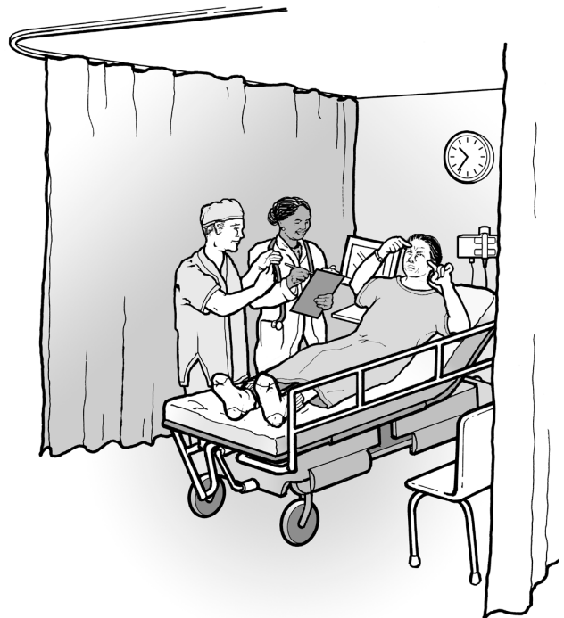
A doctor uses a sign language interpreter to communicate with a patient who is deaf.

Hospitals should have arrangements in place to ensure that qualified interpreters are readily available on a scheduled basis and on an unscheduled basis with minimal delay, including on-call arrangements for after-hours emergencies. Larger facilities may choose to have interpreters on staff.