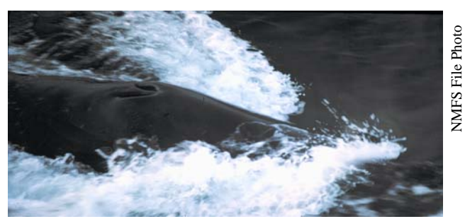
The dual blowholes of the bowhead whale make a V-shaped spout.

New advances in computer processing have improved these kinds of sound monitoring ("passive acoustic") studies. While bowheads do not use sonar (echolocation) to find their prey like dolphins and other baleen whales do, some scientists have observed bowheads making sounds while moving under ice, which might be used in finding their way around in the dark