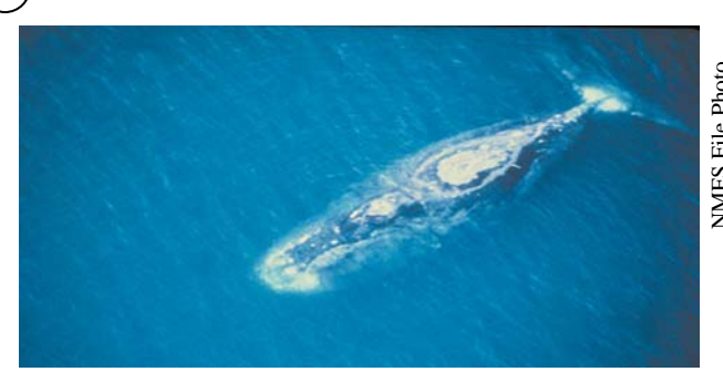
Bowhead whales must come to the surface to breathe and eat.