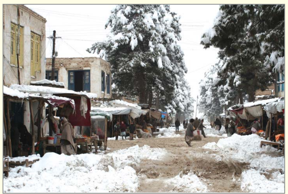
Sometimes the winters are very harsh in Meymaneh

The recent history of political parties in Afghanistan's province Faryab is one of continuous public tensions, old personal hatreds and reoccurring clashes that often date back to the civil war and Taliban raids of the 1990s. In an effort to break the animosity of the past and initiate political dialogue, the PRT Meymaneh arranged the possibility for the political parties to meet officially.