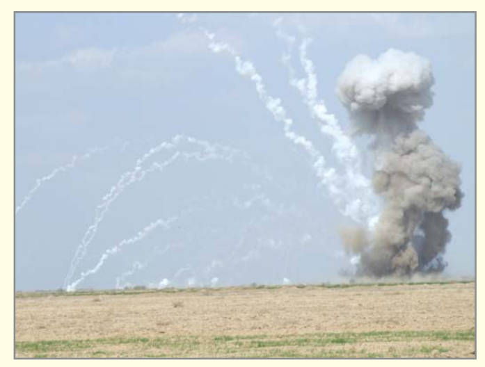
The final result of the B&H EOD unit magnificent job.

This task is difficult because some of this ammunition is rusted or damaged and can't be moved. It is necessary to destroy it on the spot.