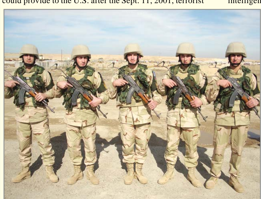
Azerbaijan Army soldiers - reliable protection for Haditha Dam.

Azerbaijan was one of the first nations to offer any help it could provide to the U.S. after the Sept. 11, 2001, terrorist