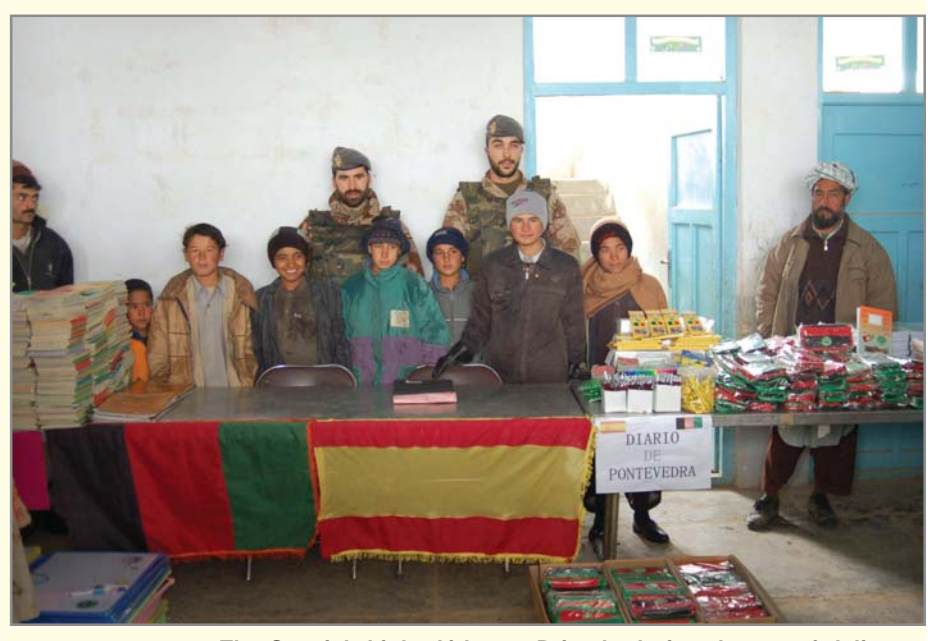
The Spanish Light Airborne Brigade during the act of delivery of 1,000 text books

According to the school's director, the number of children attending the school is 600. However, the number of students has increased about 100 from the previous year, due to the improvement in the conditions of security and the greater awareness in the matter of education.