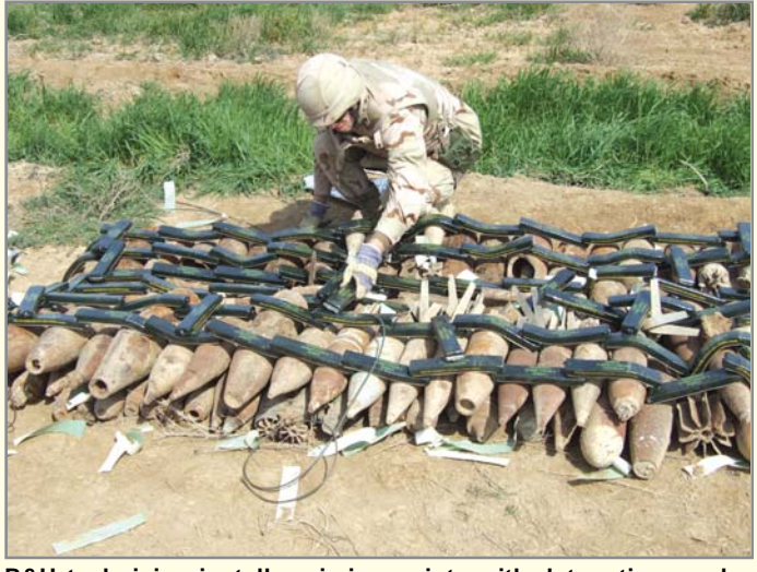
B&H technician installs priming points with detonation cord.