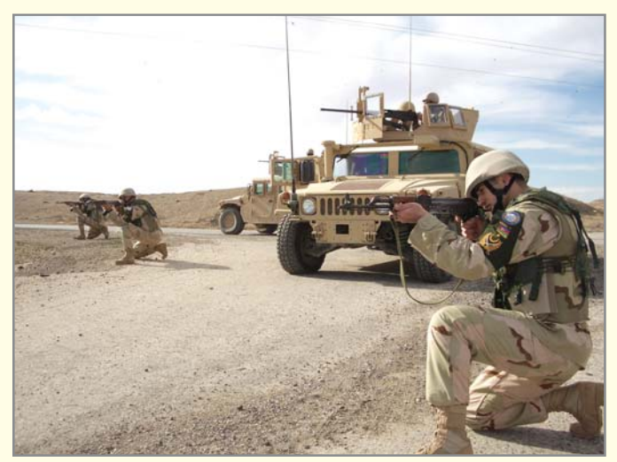
Azerbaijan Army soldiers ready to act