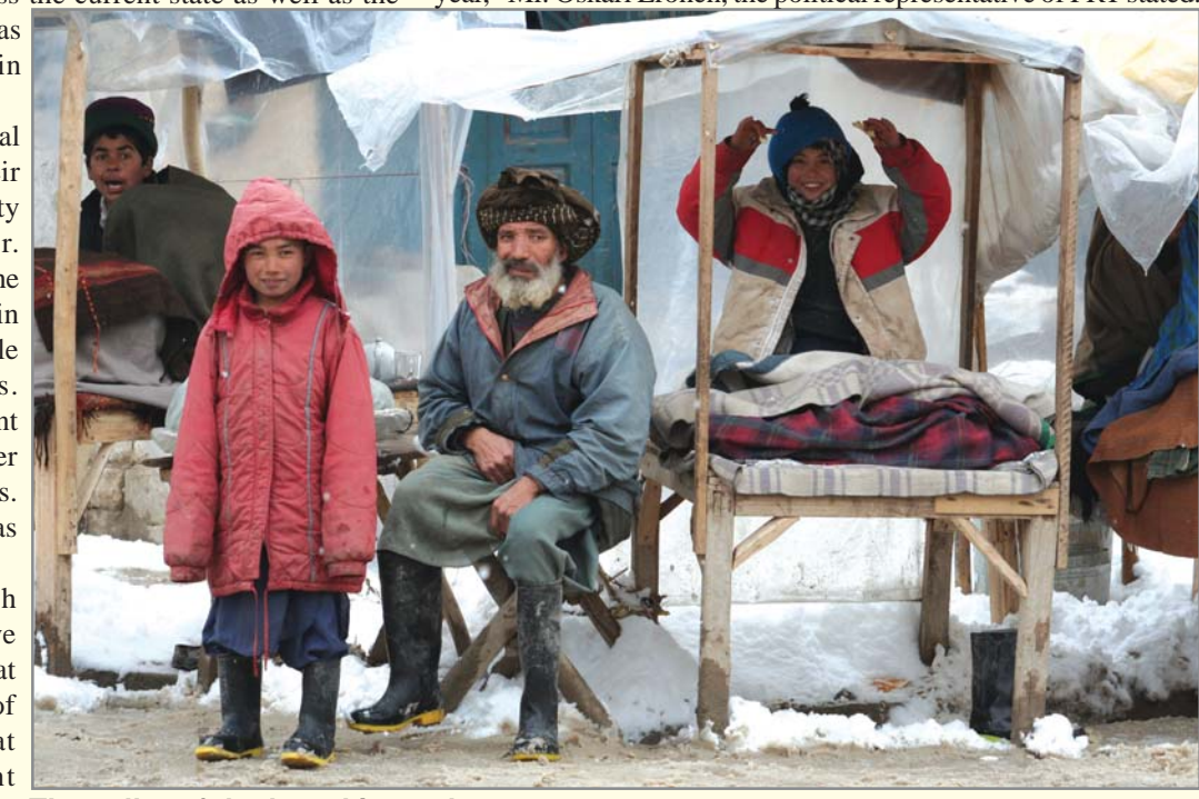
demonstrations must be avoided. The seller of the bread is ready to serve