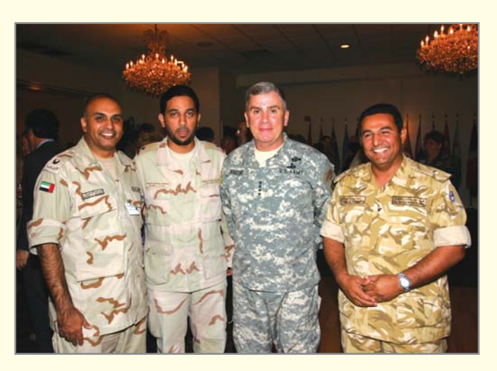
U.S.Army War College Students' Visit To CENTCOM