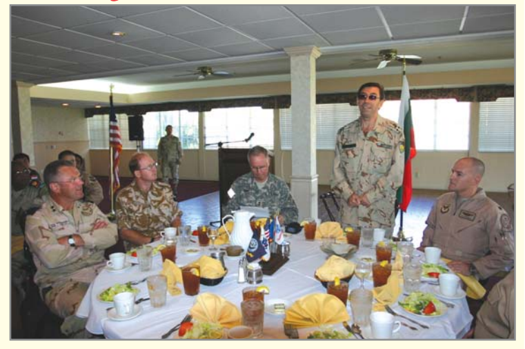
Qatar Liaison Team Visits Eckerd College