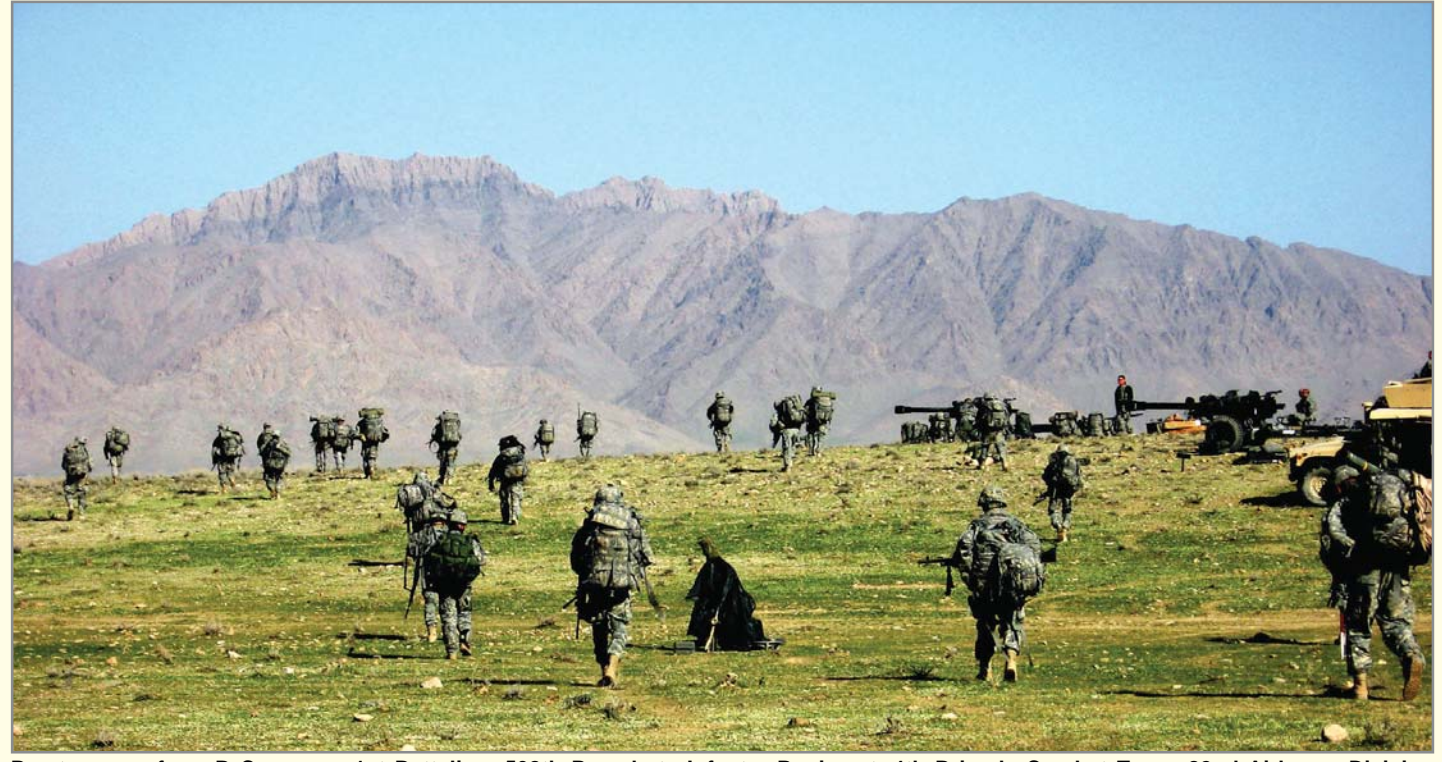
Paratroopers from B Company, 1st Battalion, 508th Parachute Infantry Regiment, 4th Brigade Combat Team, 82nd Airborne Division moves out on patrol into the Ghorak Valley of the Helmand Province in Southern Afghanistan during "Operation Achilles March 6.

KHANDAHAR AIRFIELD, Afghanistan — At the request of the Islamic Republic of Afghanistan's government, soldiers from NATO's International Security Assistance Force and the Afghan National Security Force launched a major operation targeting Taliban and drug traffickers in southern Afghanistan March 6.