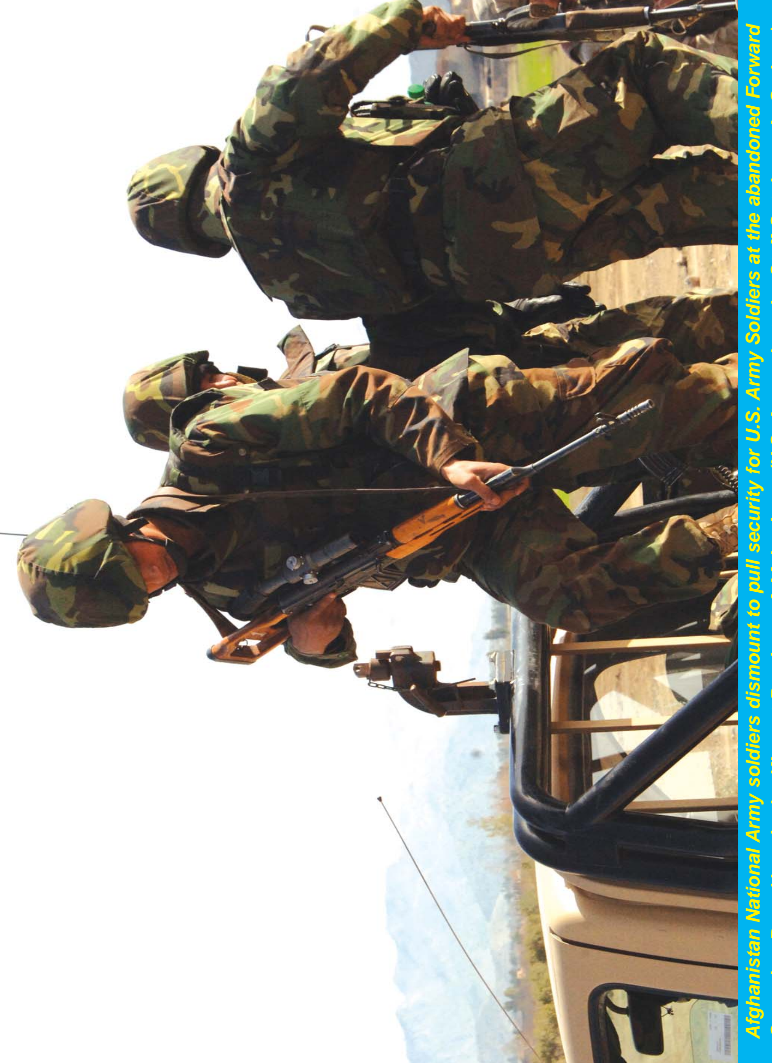
Operating Base Vega in the Khowst Province of Afghanistan