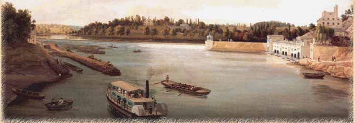
Above: Philadelphia's Fairmount Water Works was heralded in the mid-19th Century as one of the most efficient and attractive municipal water supply systems both in the United States and abroad. To the left is the canal built by the City of Philadelphia for the Schuylkill Navigation Co. (The Fairmount Water Works, by Thomas Birch (1779-1851), oil on canvas, courtesy of the Pennsylvania Academy of Fine Arts, bequest of Charles Graff.) Below: George Lehman's 1842 watercolor depicts the eight arched openings through which the water exited the Water Works after driving the water wheels, and later the turbines.

W hen Charles Dickens sailed from England in 1842 to visit Philadelphia he toured the city's Fairmount Water Works on the banks of the Schuylkill River, describing it as a place . . . "wondrous to behold."