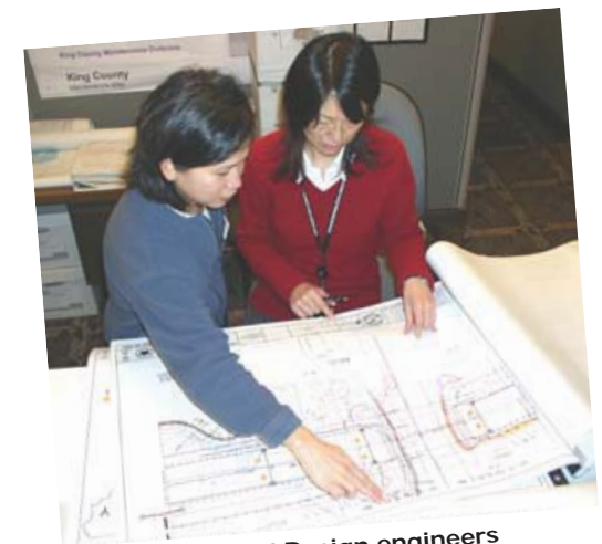
Management and Design engineers reviewing road plans