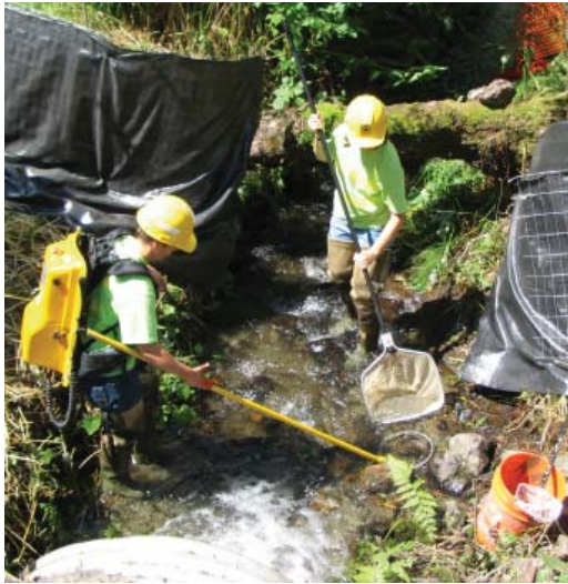
Electrofishing prior to dewatering