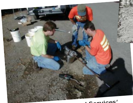
Soil sampling with Road Services' nationally-accredited Materials Lab