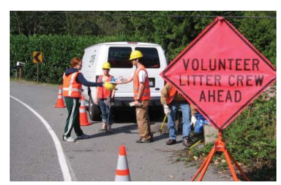
CORE Design volunteers getting hardhats and safety vests on prior to cleanup.

Volunteer groups apply to "adopt" a two mile stretch of road. Selected groups then commit to cleaning two miles of road, twice a year for two years.