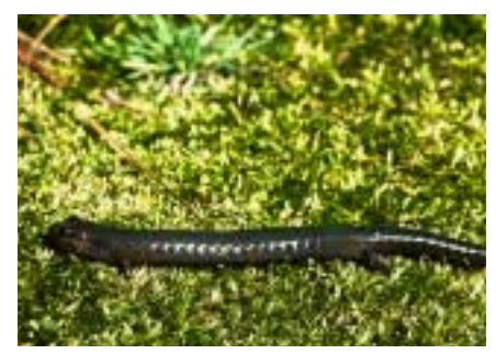
Red Hills salamander.

International Paper resulted in the issuance of a permit that increased the amount of timber available for harvest while conserving this native salamander. The HCP provided the company more management options than was originally anticipated. As mitigation for the potential "incidental take" of the salamander, the HCP establishes a "refugia" in the most optimal salamander habitat where there will be no timber harvesting conducted for the 30-year duration of the permit. In addition, there will be no cutting within these specific habitats and a 50-foot buffer will be maintained around those habitats. To facilitate implementation of the HCP, training workshops are required for all of International Paper's foresters and technicians who work in the HCP planning area. The workshops will train the employees to recognize habitat types, and properly establish buffers, and will familiarize them with the details of the HCP, as well