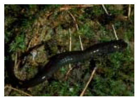
Red Hills salamander.