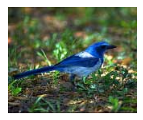
Florida scrub jay.

With limited acreage, individuals face a special challenge in developing HCPs without the process becoming burdensome, because ultimately, the individual is still required to minimize and mitigate for the activity. The specific challenge facing Mary Presley, a private landowner, was how the FWS could help her develop a plan that allowed her to build a private residence in scrub jay habitat while protecting the listed scrub jay. The Florida scrub jay is native to peninsular Florida and found throughout the specific area where the Presleys wanted to build a house. The jay is found in numerous areas, and development, both large- and small-scale, has encroached on its habitat. This long-lived bird is highly territorial and if its habitat is destroyed, it typically perishes. The FWS must work with all of the applicants in the HCP process to provide consistency throughout the bird's range, ensuring that the cumulative effect of many individual permits will not threaten its survival and recovery.