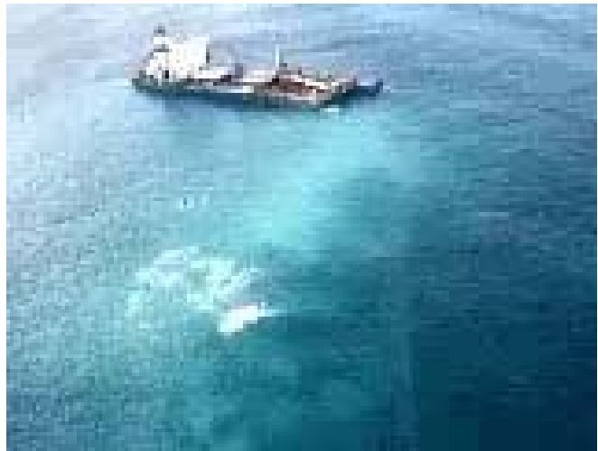
Selendang Ayu sinking with its load of crude oil.