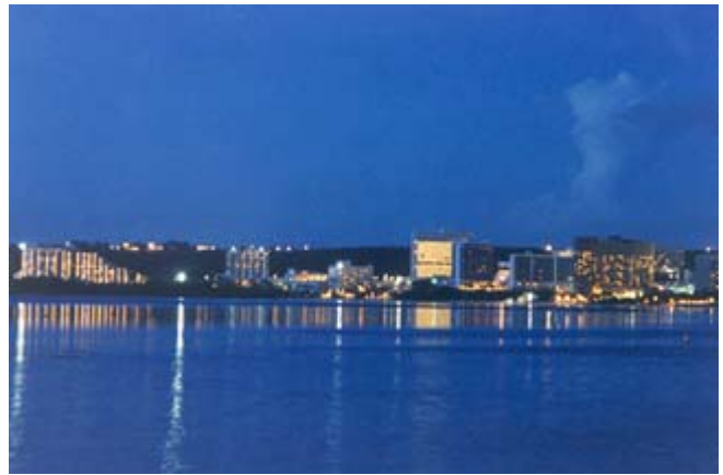
Guam's beautiful Pacific shoreline at night.

NOAA has developed a new rip current brochure in English and Spanish, outdoor information signs for posting by municipalities along boardwalks and beachfronts and a website full of rip current information, links, photos and templates for brochures and signs. Help us spread this lifesaving information to others. You can access the website at http://www.ripcurrents.noaa.gov . ❄