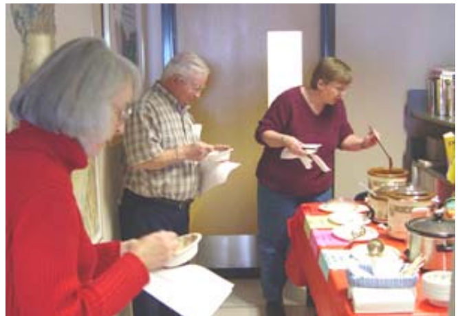
Emergency Coordinators sample the chili.

Have you ever dreamed of combining the cold of winter with the heat of the southwest? WFO Pocatello, ID, used the unusual duo to draw media, Homeland Security Staff, Natural Resources Conservation Service and EM managers to its second annual Groundhog Day Chili Cook-Off Contest and Hydrologic Outlook Briefing on February 2.