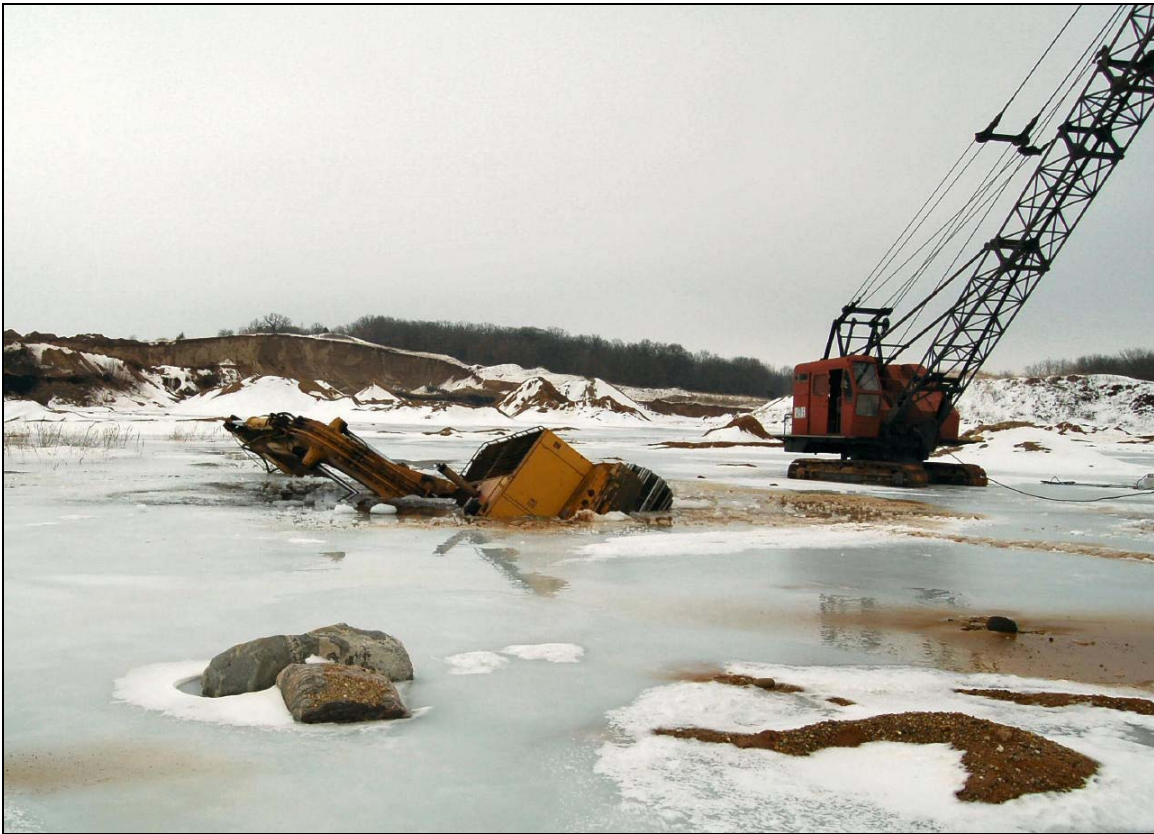
Photo of Accident Scene

The accident occurred because management policies and procedures failed to address the hazard created by an ice-covered, water-filled ditch. All hazards associated with the task were not identified and appropriate controls were not in place to ensure that persons could safely perform the task. Barricades or warning signs, visible from all approaches, were not erected to warn persons of a hazard that was not immediately obvious.