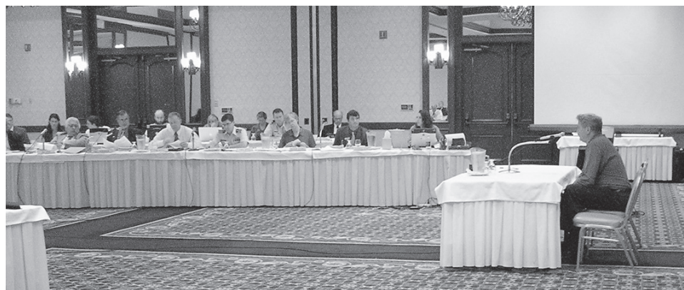
Figure 1: Public Testimony before the Pacific Fishery Management Council