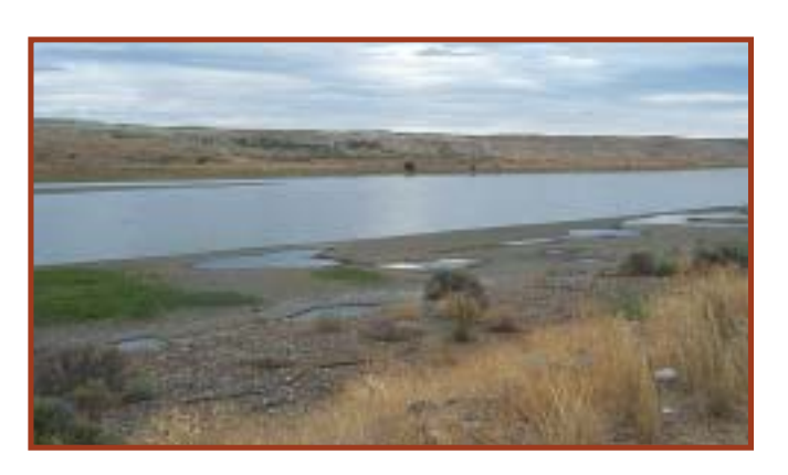
Columbia River, Hanford Reach

The Board issued Advice #152 to provide feedback on the TPA agencies' proposed change package for milestone M-24, which addresses the site's groundwater monitoring system. While the Board was pleased that the change package had been negotiated, it did not believe the changes in the well-drilling milestone would "assure creation of a compliant monitoring network." The Board recommended DOE fully fund drilling of all 67 wells; that a compliant monitoring network be