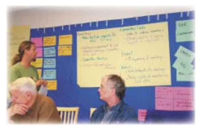
Leadership Retreat 2003

Completing its ninth year and moving into its tenth, the Board's body of work now includes more than 150 pieces of advice— a body of work that has had significant effects on Hanford cleanup decisions.