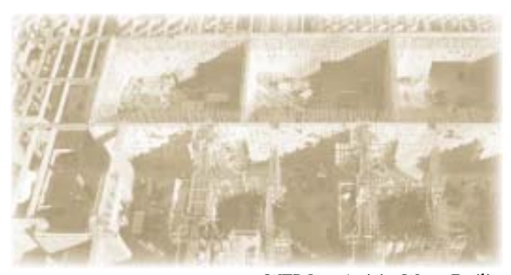
WTP Low Activity Waste Facility