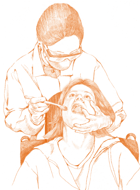
Positioning for treating a patient in a wheelchair. Note the support a sliding board can provide. Sliding or transfer boards are available from home health care companies.

UNCONTROLLED BODY MOVEMENTS can jeopardize safety and your ability to deliver dental care. Pay special attention to the following: